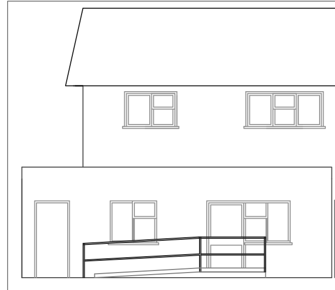
PROPOSED REAR ELEVATION (1:100)