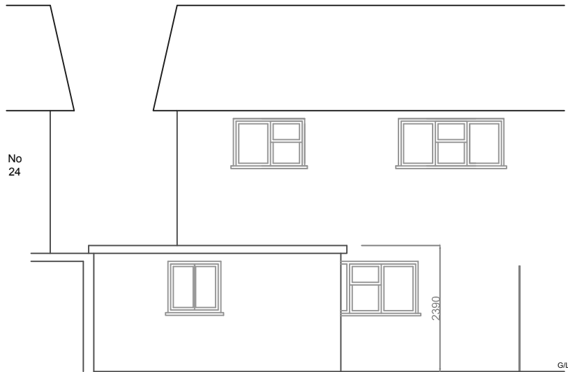
EXISTING REAR ELEVATION (1:100)