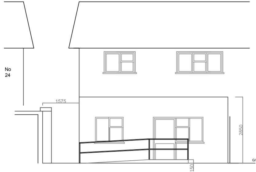
PROPOSED REAR ELEVATION (1:100)