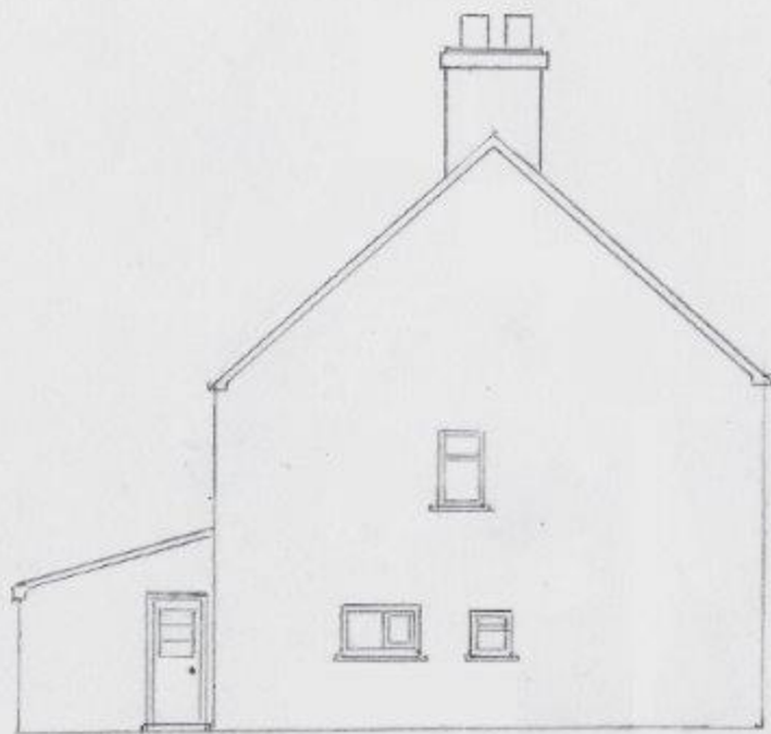
Existing Side Elevation 1:100