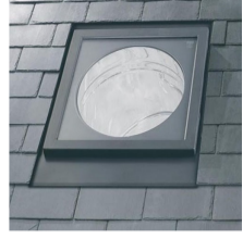
Flush mounted Sun-pipe Ref: Velux TLF 0K14 2010