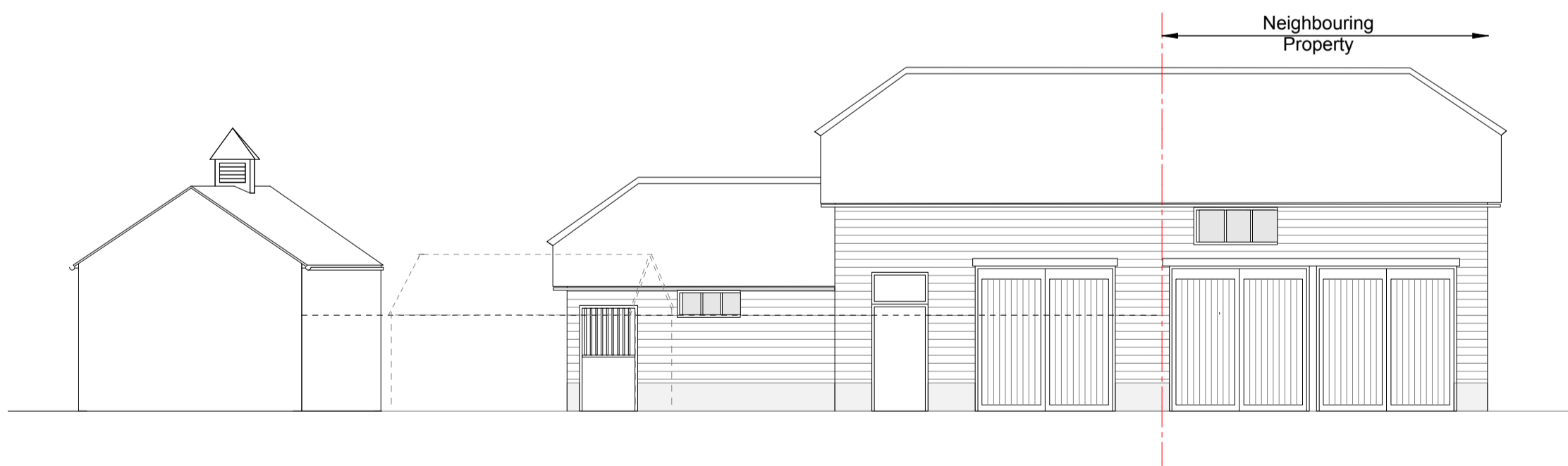
01 EXISTING NORTH BARN ELEVATION