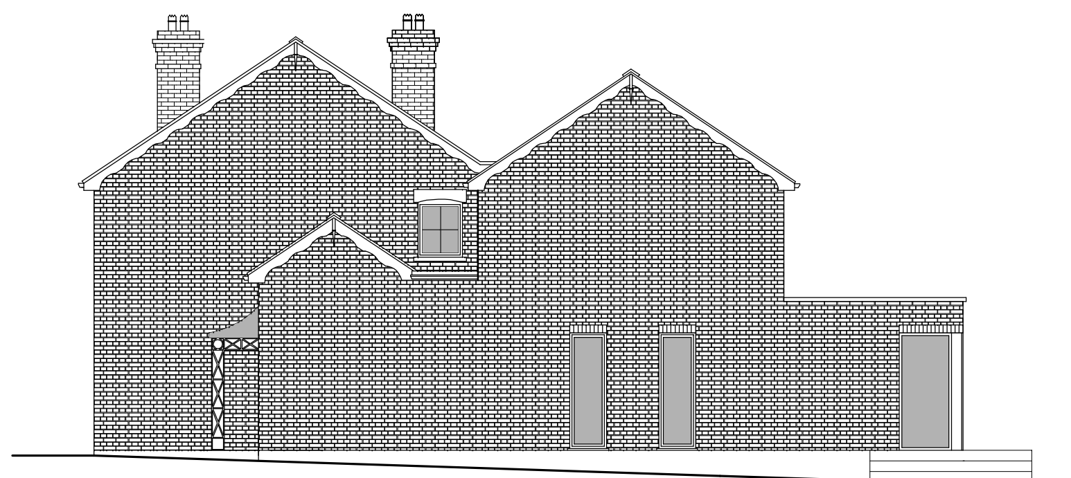
Proposed Right Side Elevation