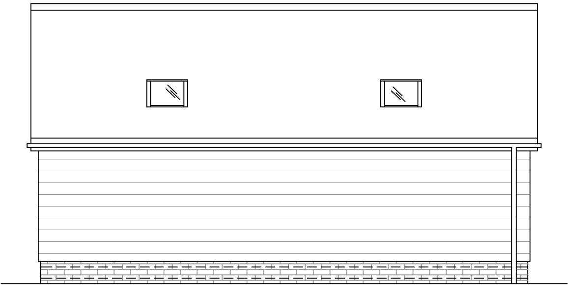
Proposed East elevation