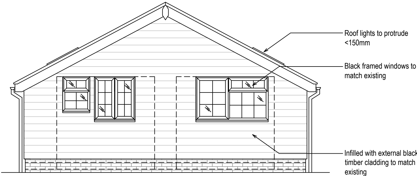
Proposed South elevation