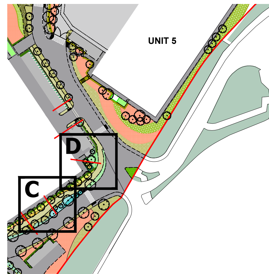
Section Location Plan C & D