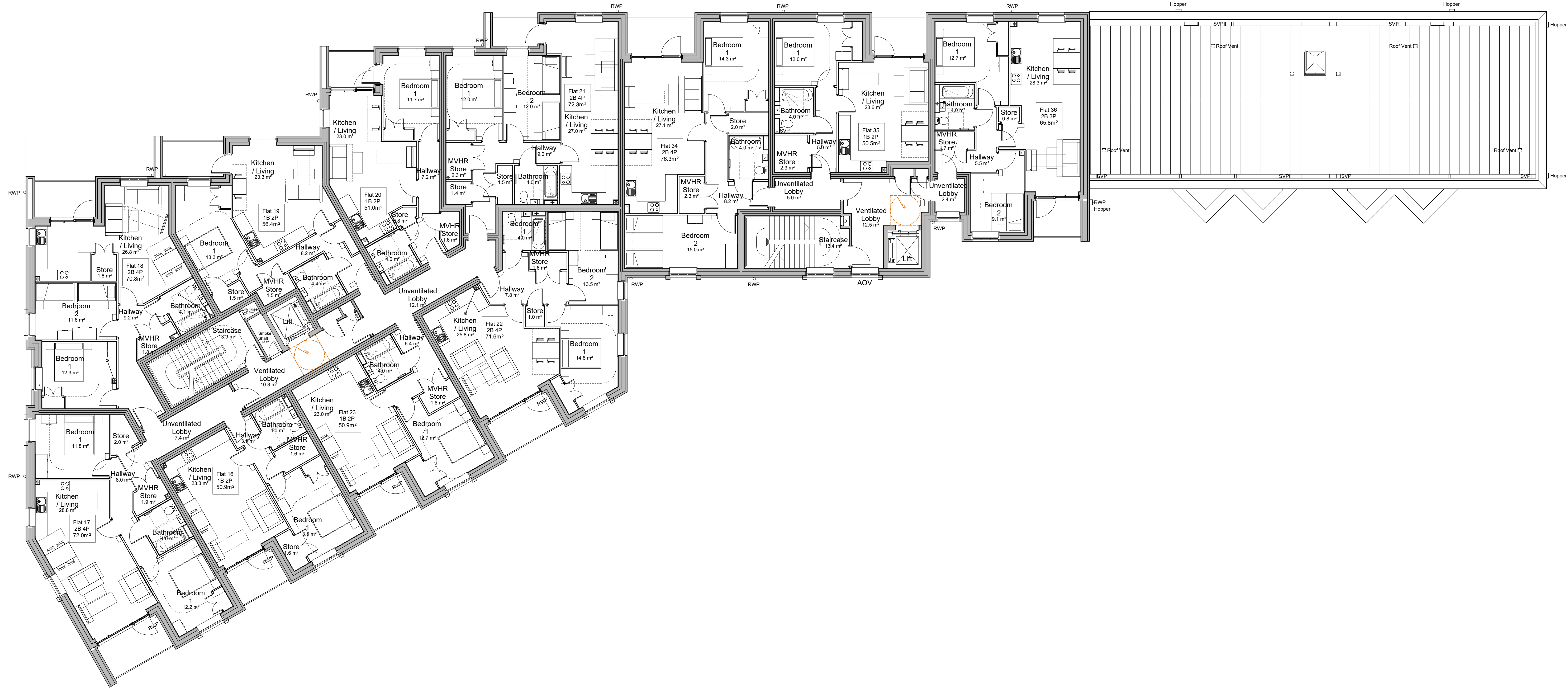
2nd floor plan [A1 1:100]