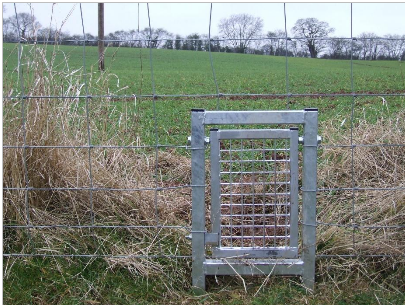
Plate 1: Example of a galvanized steel mammal gate within a deer fence that will be installed within the fence line.