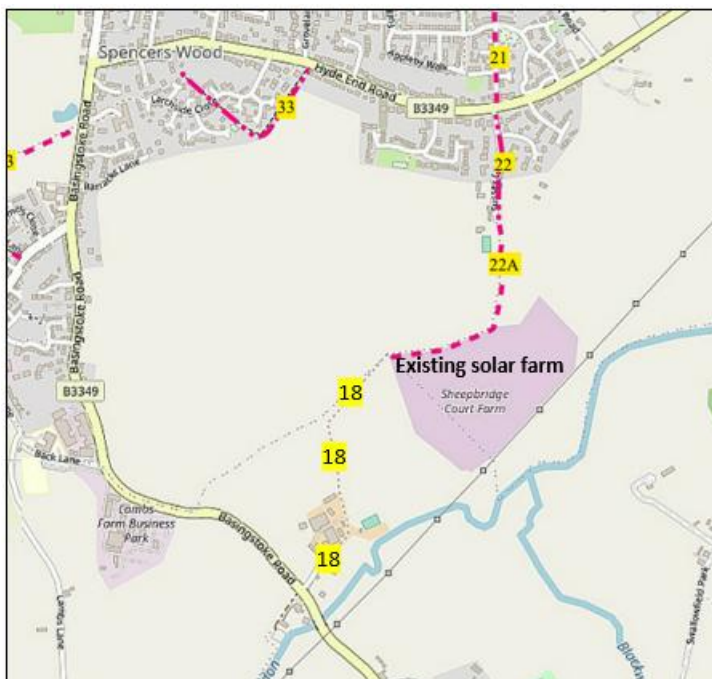
Figure 1: Location of PRow Swallowfield 18 and Shinfield 22A