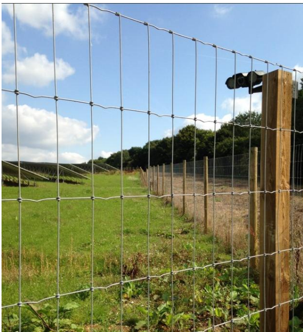
Plate 1: Example of timber fence posts with galvanised steel wire mesh fencing.

2.1 The perimeter of the solar farm will be enclosed by deer fencing with posts set at 6 metre intervals. Fence posts will be retained in their natural wood colour with galvanised steel wire mesh fencing. The finishes will be consistent with that shown in Plate 1.