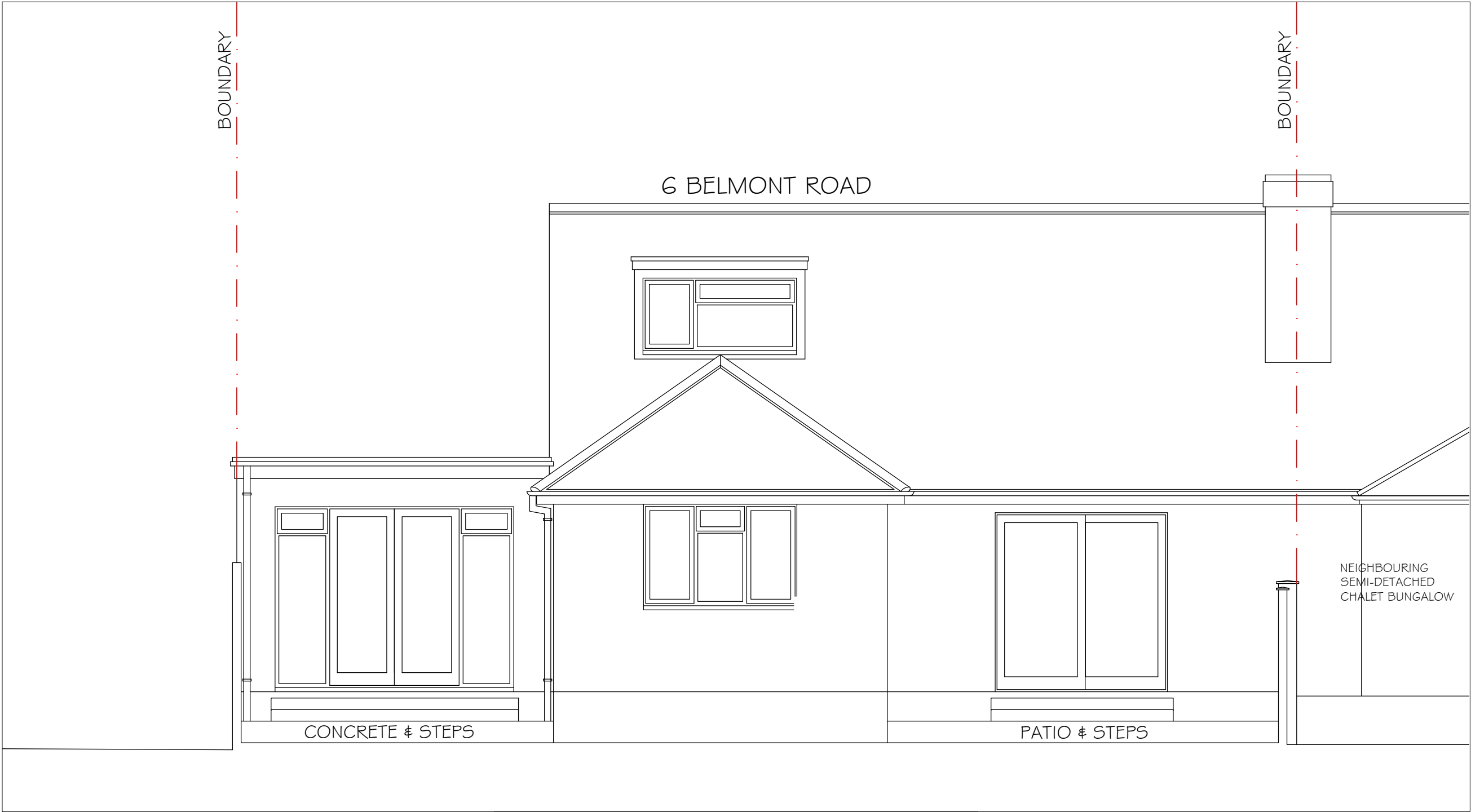
FORMER REAR ELEVATION 1:50