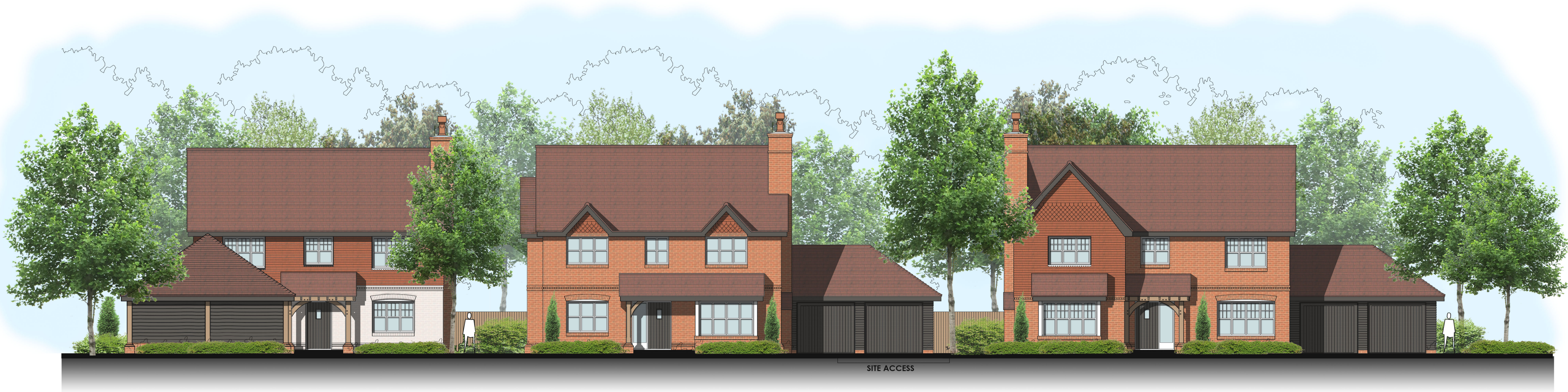
INDICATIVE STREET SCENE THROUGH SITE

Notes: This drawing is the copyright of Andrew Malcolm and has been sent to you in confidence, it must not be reproduced or disclosed to third parties without our prior permission. Do not scale from this drawing except for planning purposes. All dimensions are in millimetres unless noted otherwise. Any surveyed information incorporated on this drawing cannot be guaranteed as accurate unless confirmed by a fixed dimension. This drawing is to be read in conjunction with all the relevant consultants, suppliers and manufacturers drawings and information.