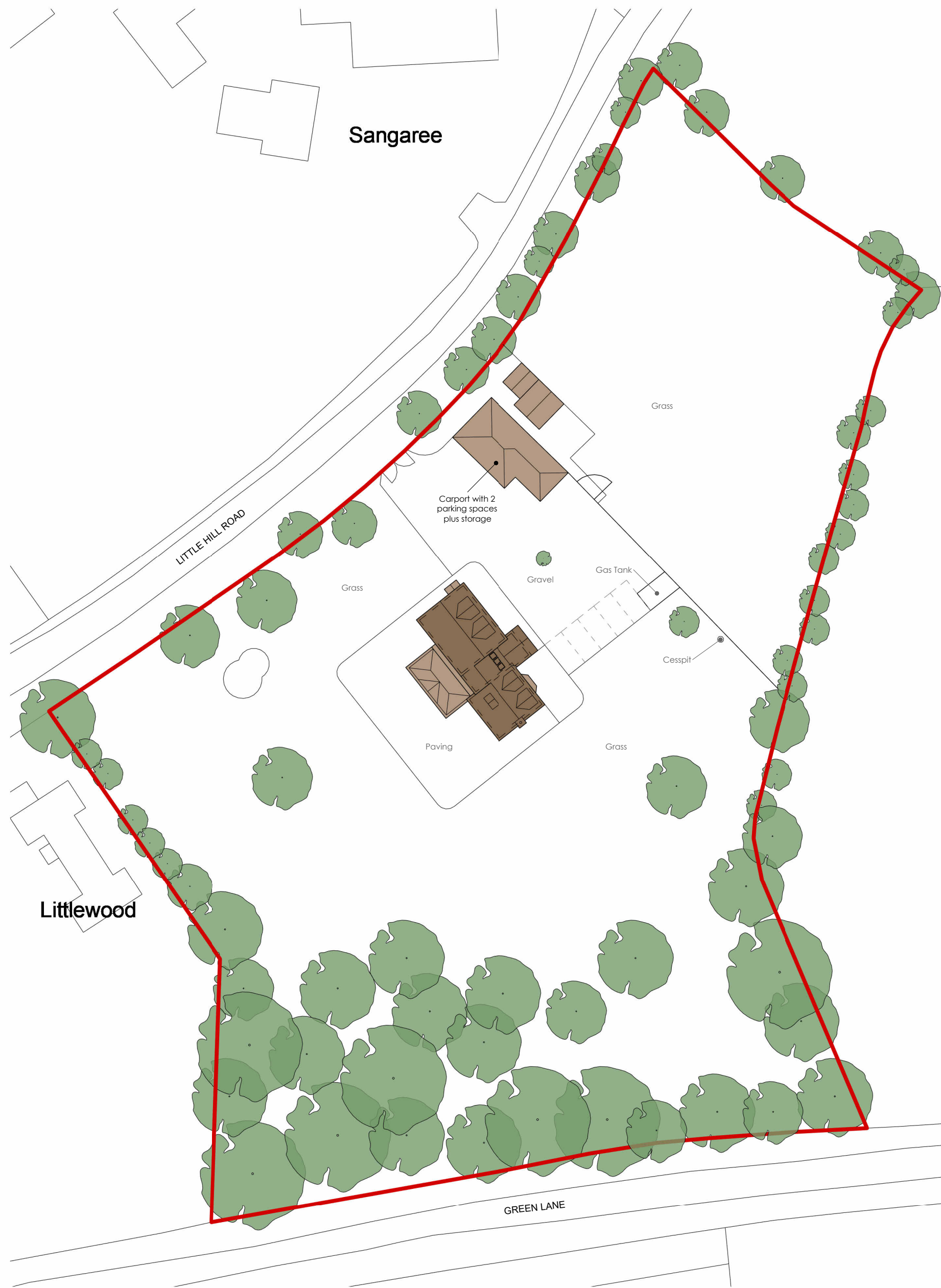
SITE - EXISTING 1 : 500