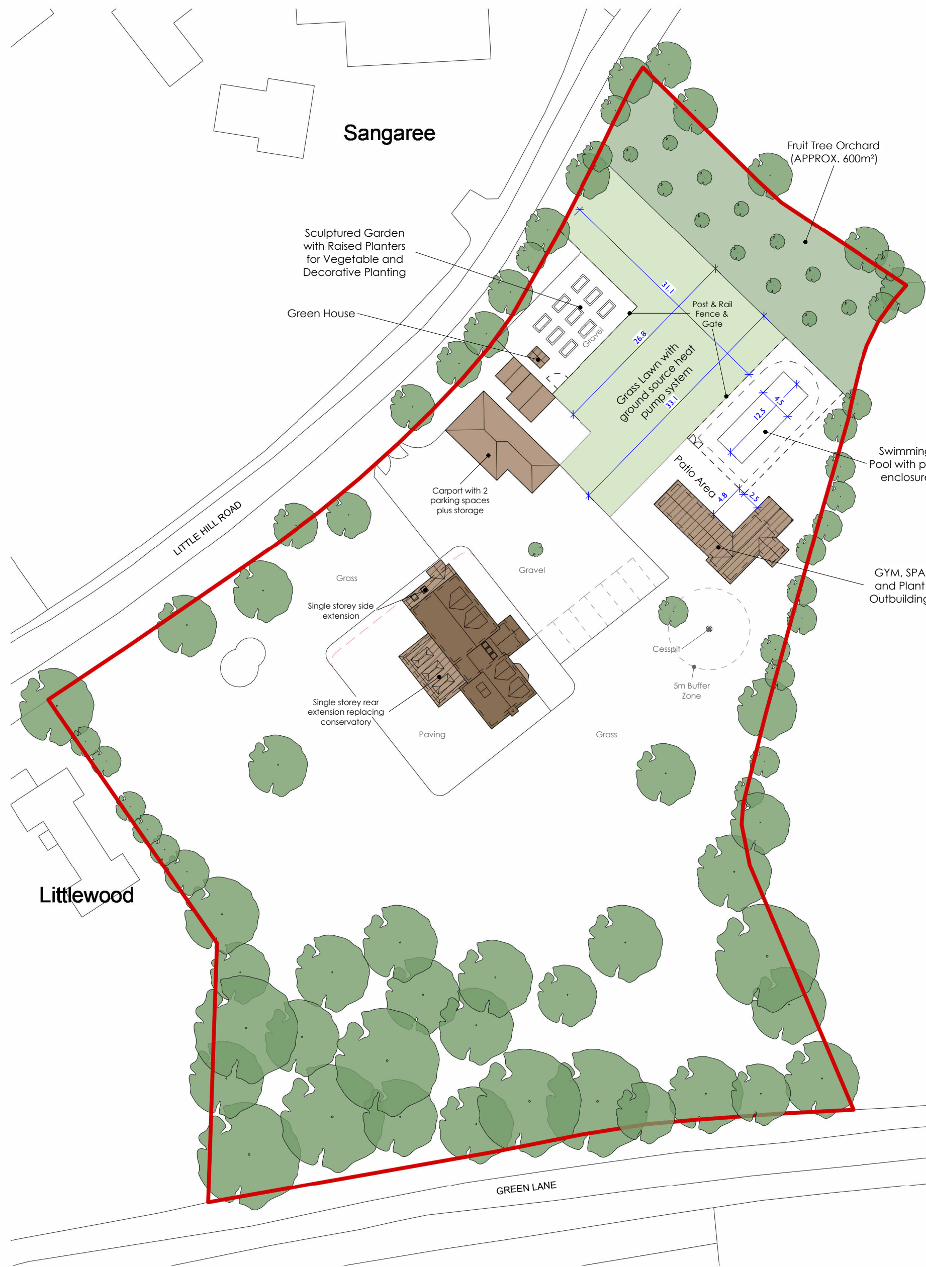
SITE - PROPOSED 1 : 500