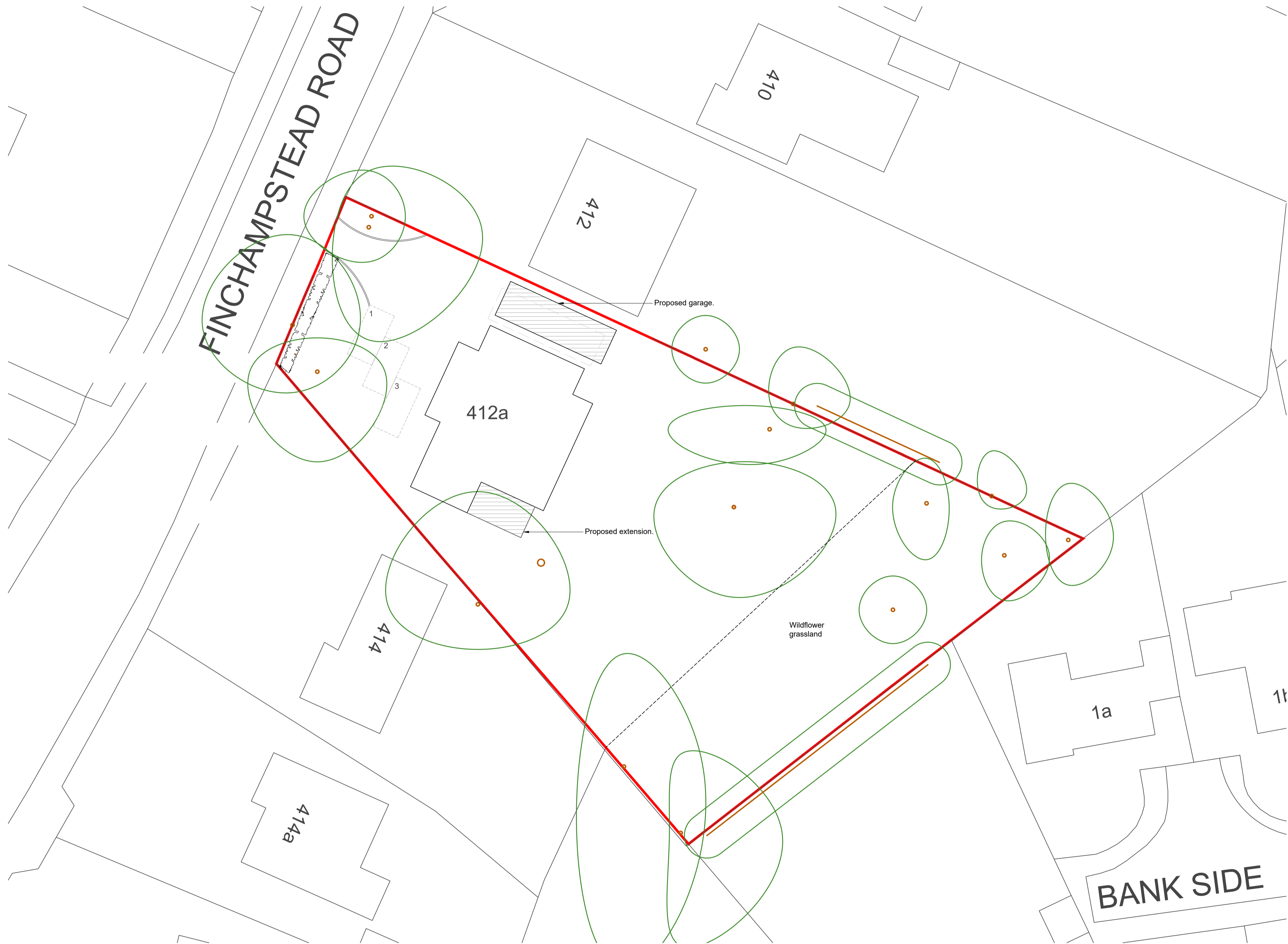
Site Plan 1:200