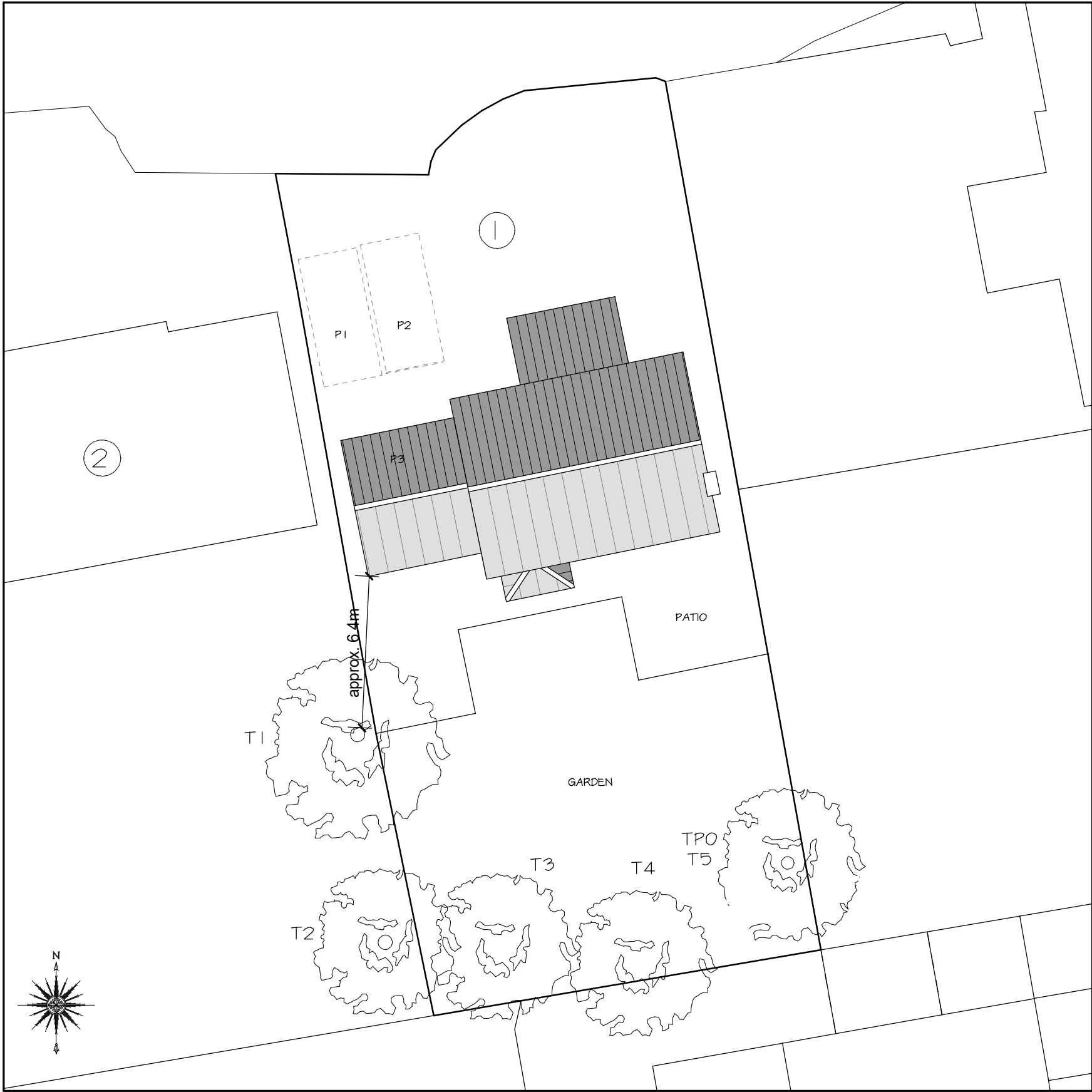
EXISTING BLOCK PLAN 1:200

T1 GYCAMORE T2 SILVER BIRCH T3 PLUM T4 JAPANESE ACER T5 TPO (REPLACED AS PER PREVIOUS PLANNING APPLICATION) MAGNOLIA GRANDIFLORA