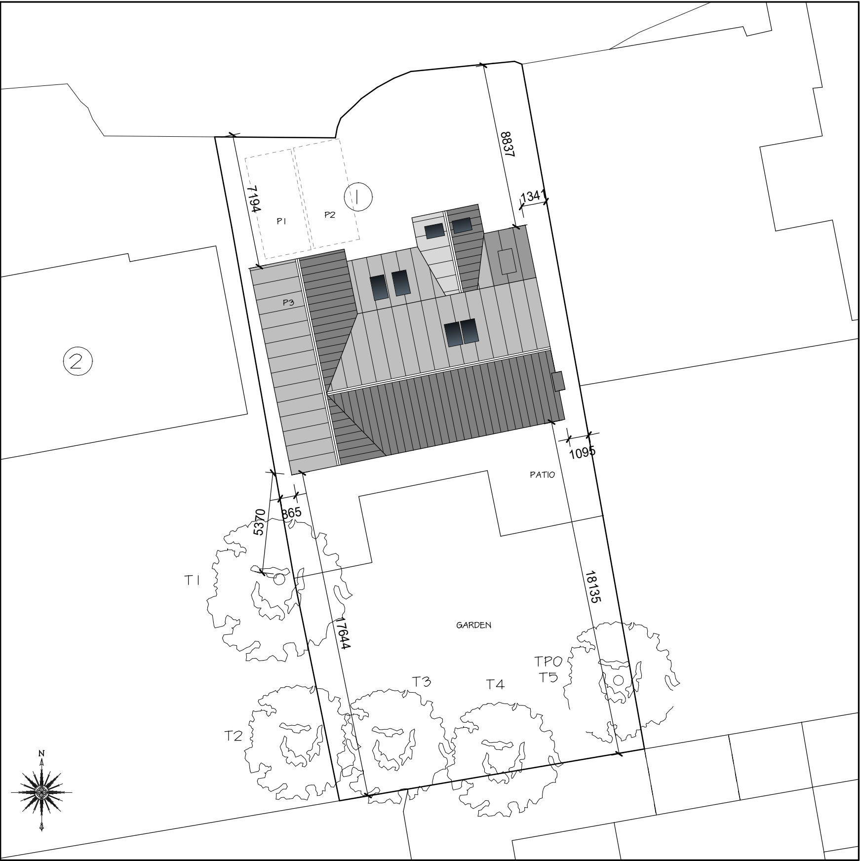
PROPOSED BLOCK PLAN 1:200

T1 GYCAMORE T2 SILVER BIRCH T3 PLUM T4 JAPANESE ACER T5 TPO (REPLACED AS PER PREVIOUS PLANNING APPLICATION) MAGNOLIA GRANDIFLORA