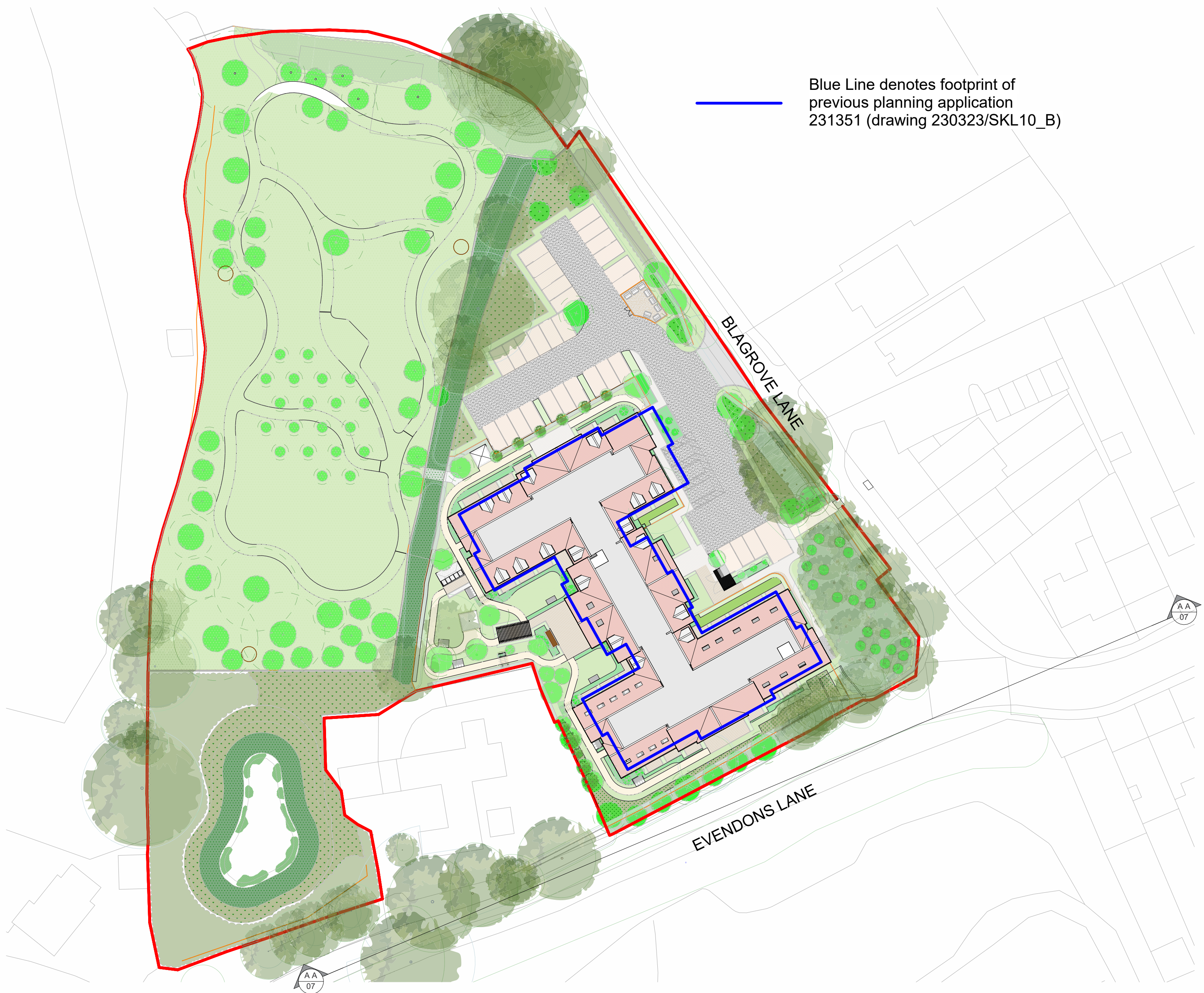
Site Section Key 1 : 500