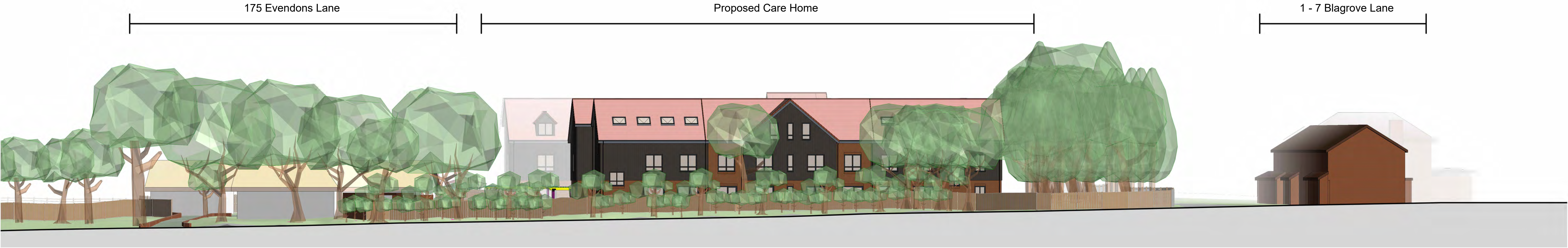
Site Section AA - With Indicative Trees 1 : 200