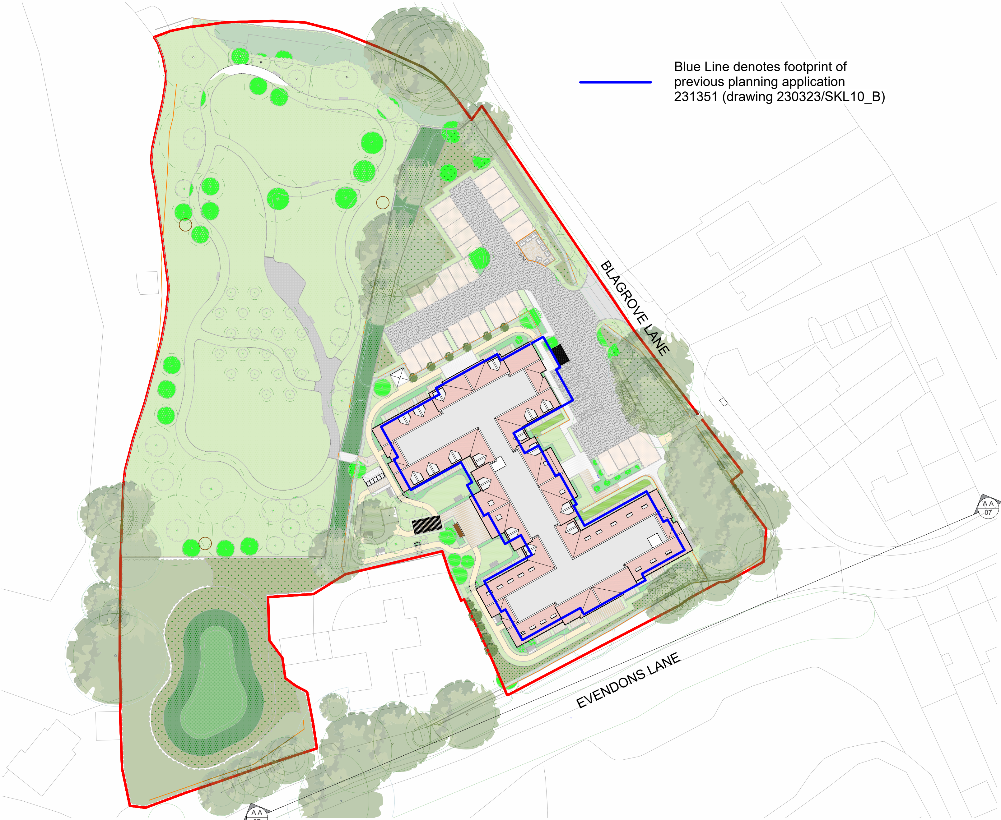
Site Section Key 1 : 500