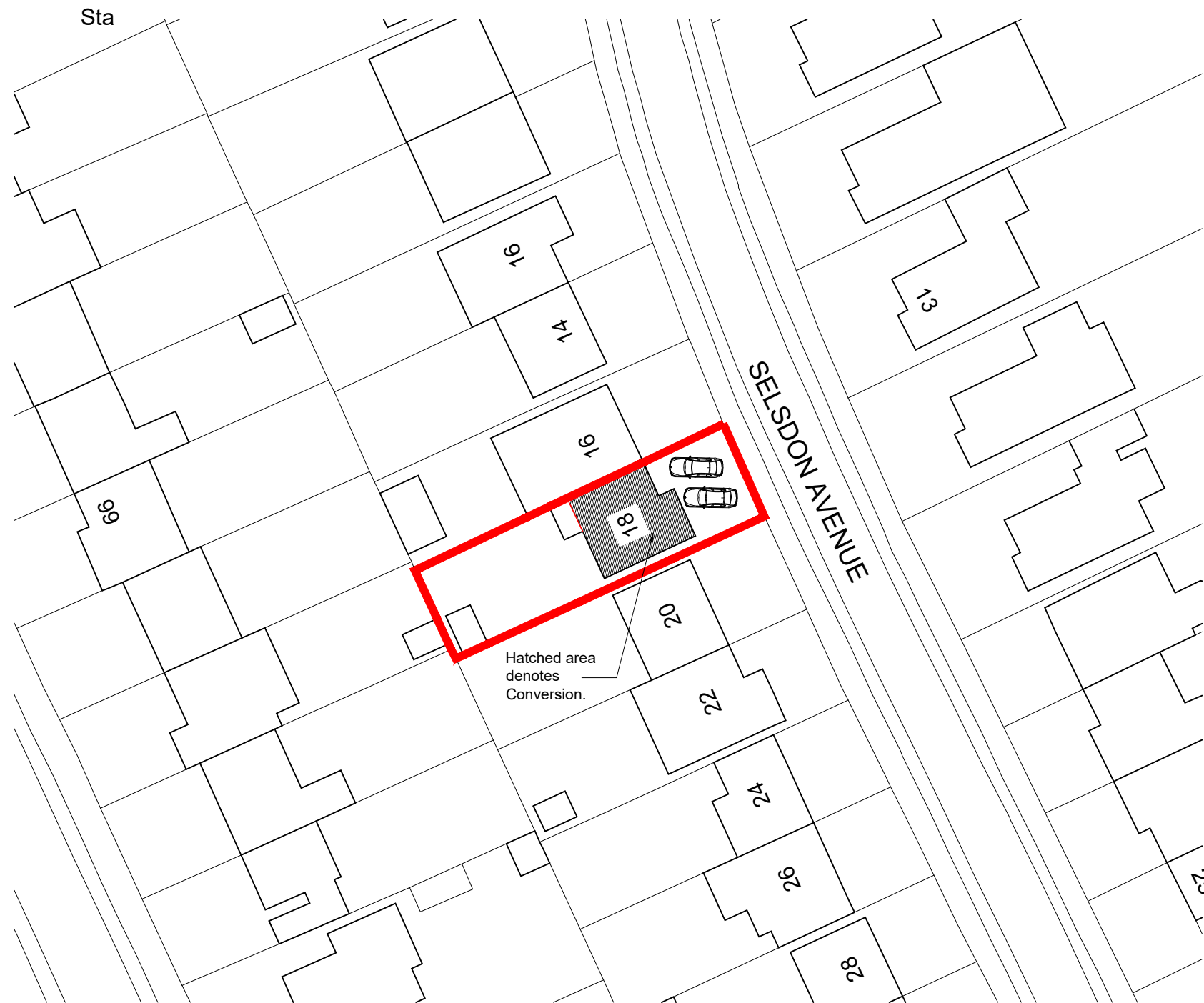
Licence number 100022432 BLOCK PLAN SCALE 1 : 500