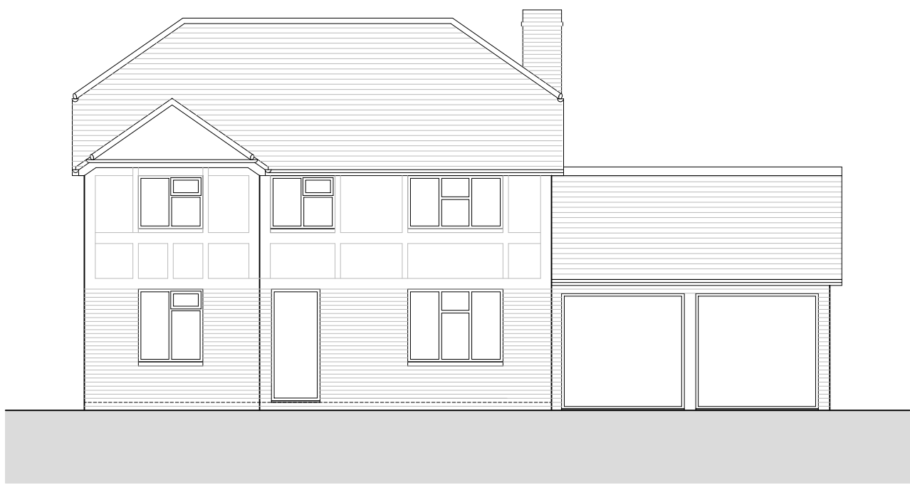
EXISTING EAST ELEVATION SCALE 1 : 100

THIS DRAWING IS TO BE READ IN CONJUNCTION WITH ALL OTHER DRAWINGS AND DOCUMENTS PROVIDED. THE CONTRACTOR MUST CHECK ALL DIMENSIONS ON SITE BEFORE PLACING ORDERS FOR MATERIALS OR SHOP FABRICATIONS OR COMMENCING WORKS ON SITE. ANY DISCREPANCIES SHOULD BE NOTIFIED BEFORE PROCEEDING.