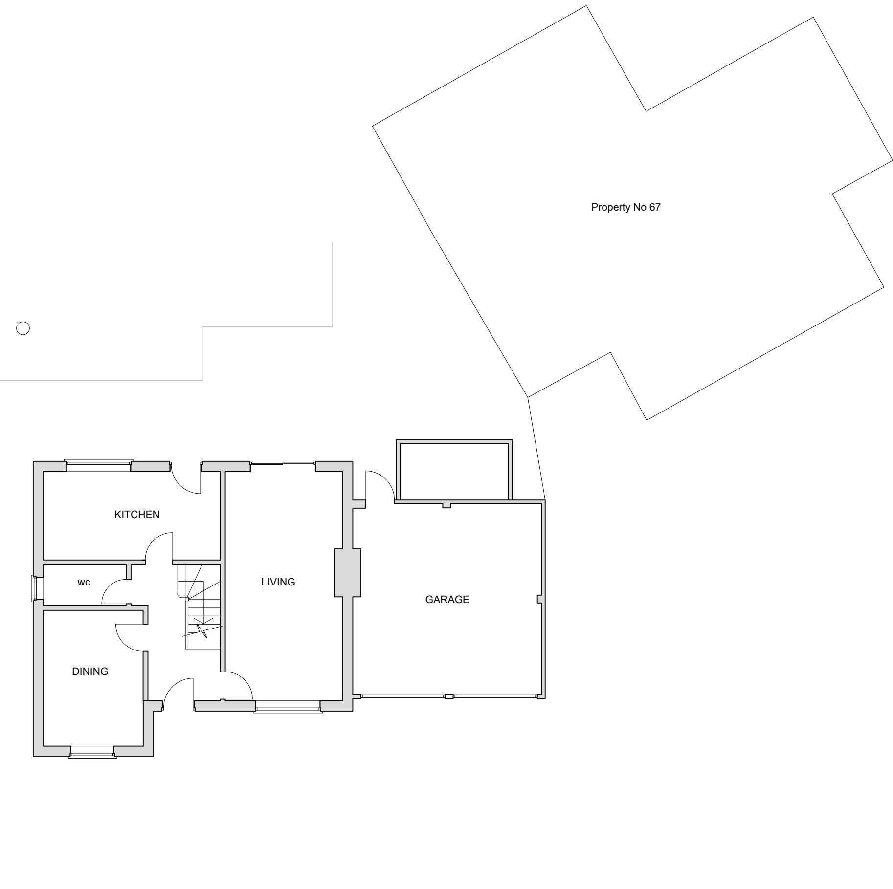
EXISTING GROUND FLOOR PLAN SCALE 1 : 100