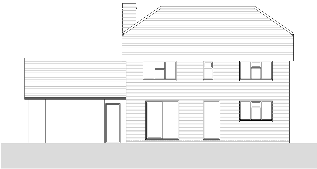
EXISTING WEST ELEVATION SCALE 1 : 100