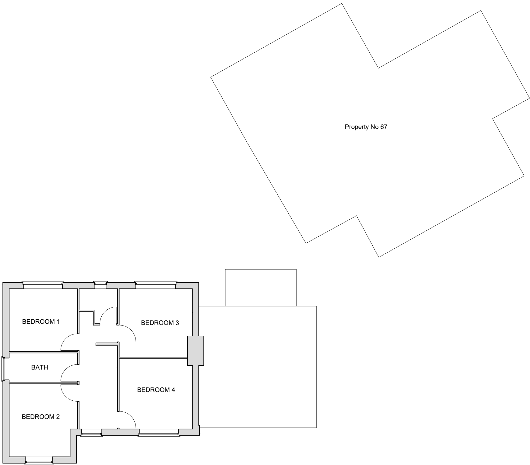
EXISTING FIRST FLOOR PLAN SCALE 1 : 100