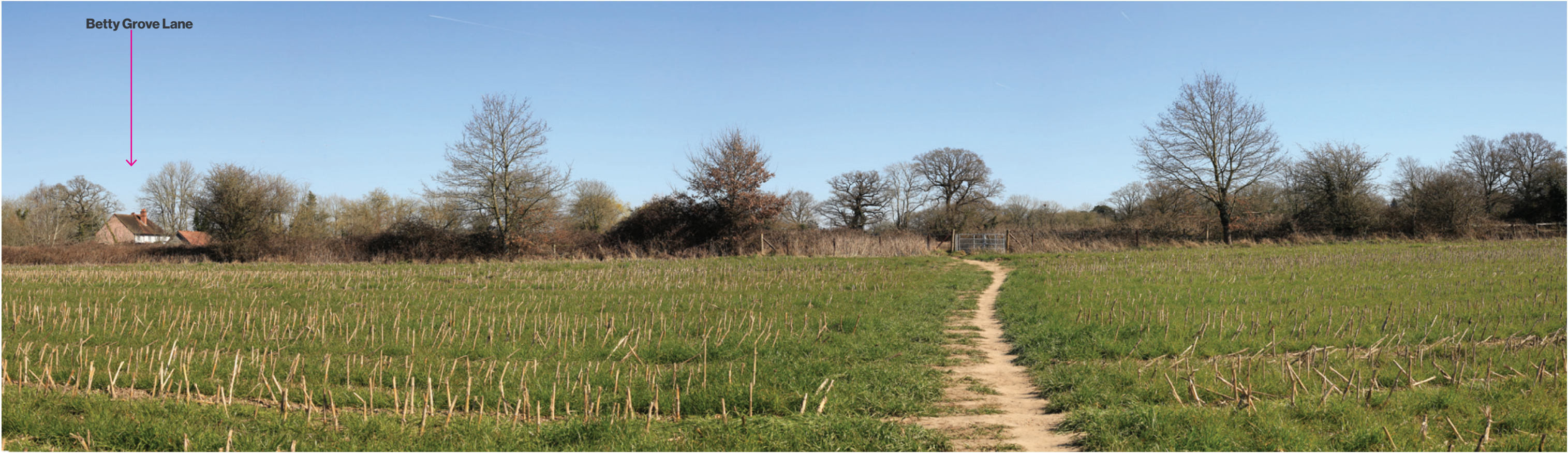
View 17: From PRoW ARB05A, looking north-east towards Betty Grove Lane across area that would be developed for new-build plots