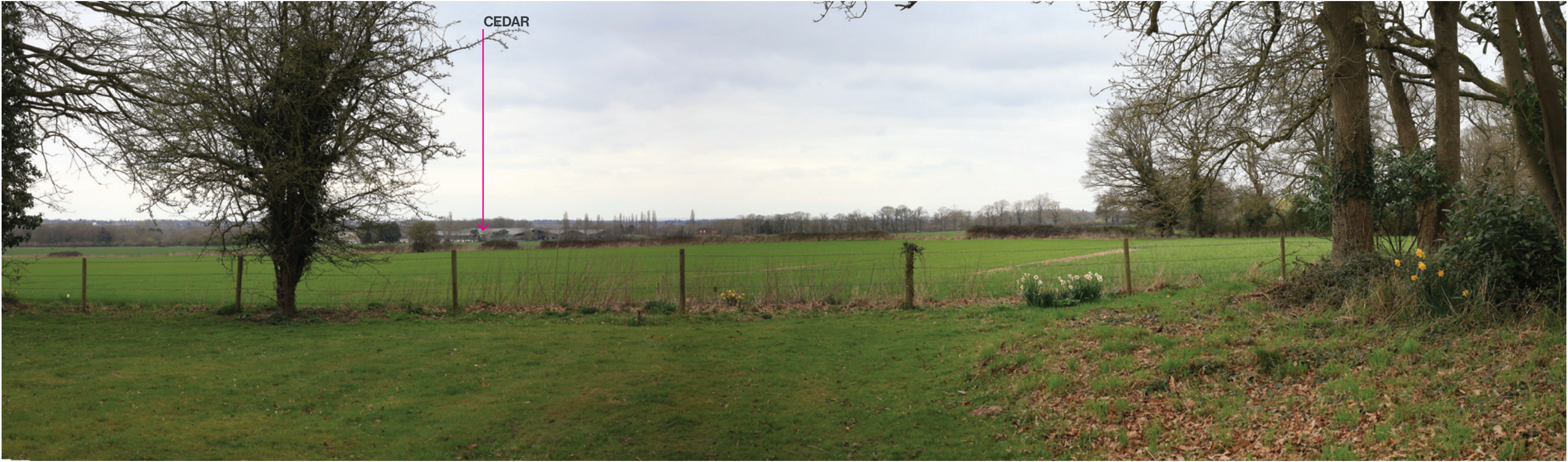
View 13B: From grounds of St. Bartholomew's Church, Arborfield looking north. Here there would be an extension to the burial ground with further green space and homes beyond. Whilst the view would change, the grounds would remain part of a wider open space and new village green.