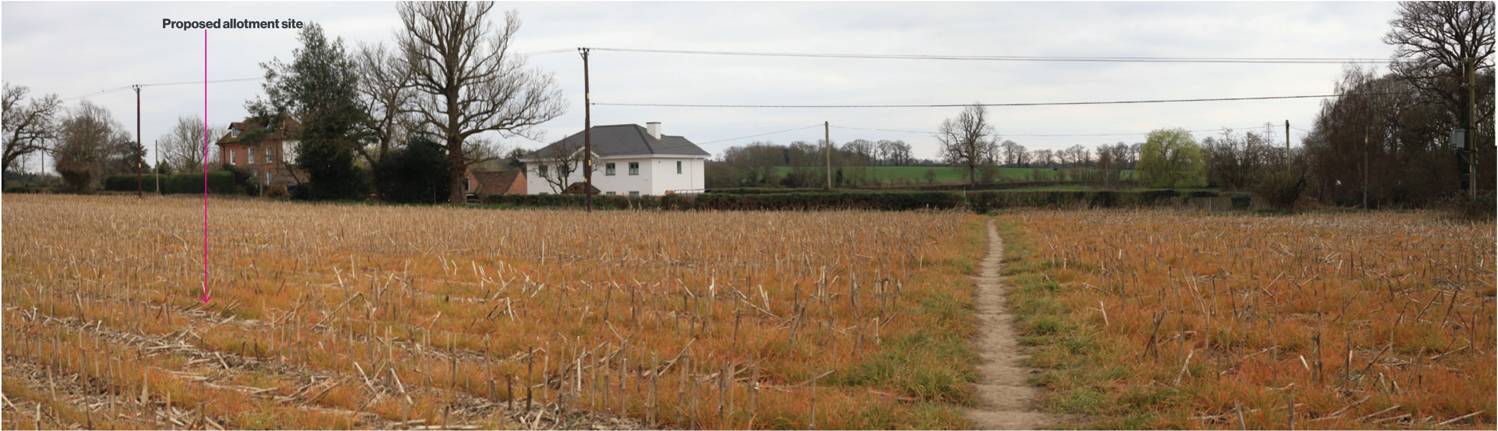
View 18: From PRoW ARB05A, looking south-west towards Carter's Hill adjacent to proposed allotment area. The Proposed Development Area is visible in the distance.