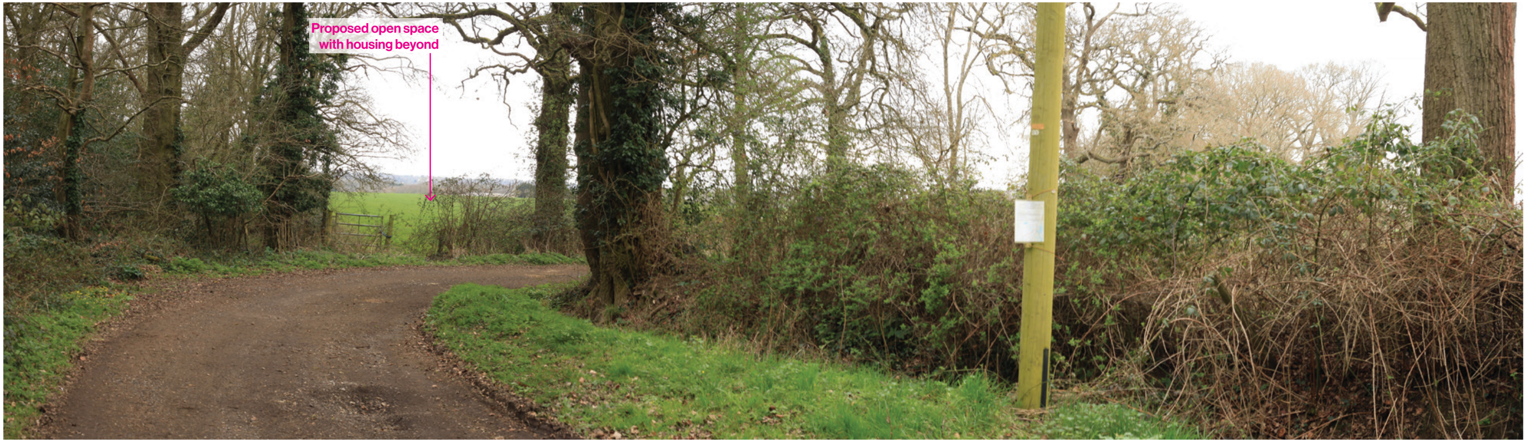
View 12: View from PRow ARBO3 looking north towards southern part of the site. This area includes new public open space which can accommodate mitigation planting to help screen new housing beyond during the summer months. During the winter however, the view would include new homes and appear less rural in character.