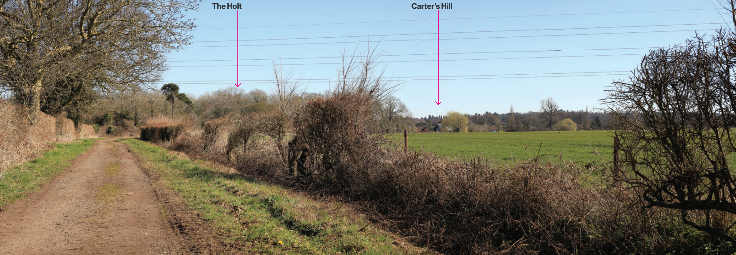
View 19A: From PProW ARB03, looking east toward's Carter's Hill. This route would run through a retained green corridor. New homes beyond would visually enclose the space and curtail the views of Carter's Hill. The setting of the view would therefore change significantly, from rural to a new village.

Published for the purposes of identification only and although believed to be correct accuracy is not guaranteed.