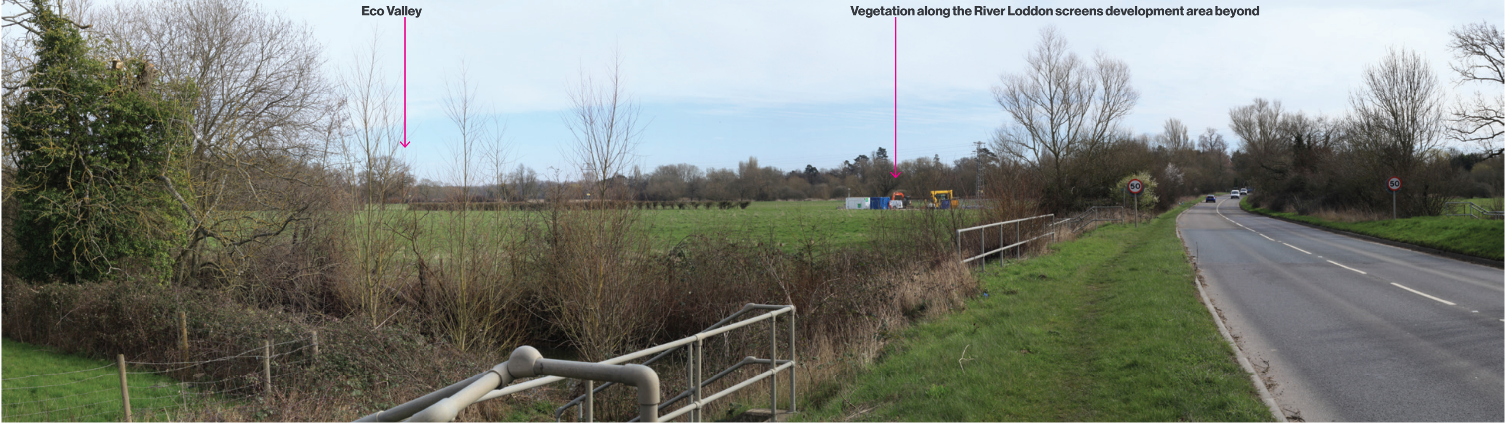
View 16: From A387 Arborfield Road, looking east. Eco Valley area is visible in the foreground but the proposed built development is screened by vegetation along the river corridor.