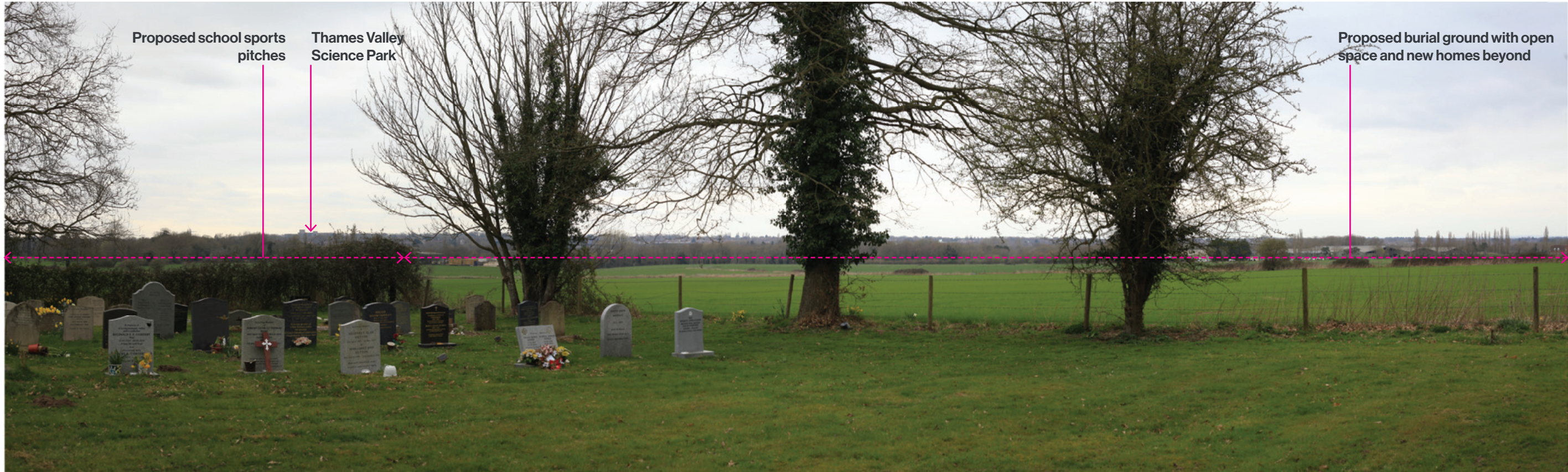
View 13A: From grounds of St. Bartholomew's Church, Arborfield. The view to the north-west would remain open, overlooking a corridor of open space and school playing fields, with homes beyond. To the north there would be an extension to the burial ground with further green space and homes beyond. Whilst the view would change, the grounds would remain part of a wider open space and new village green.