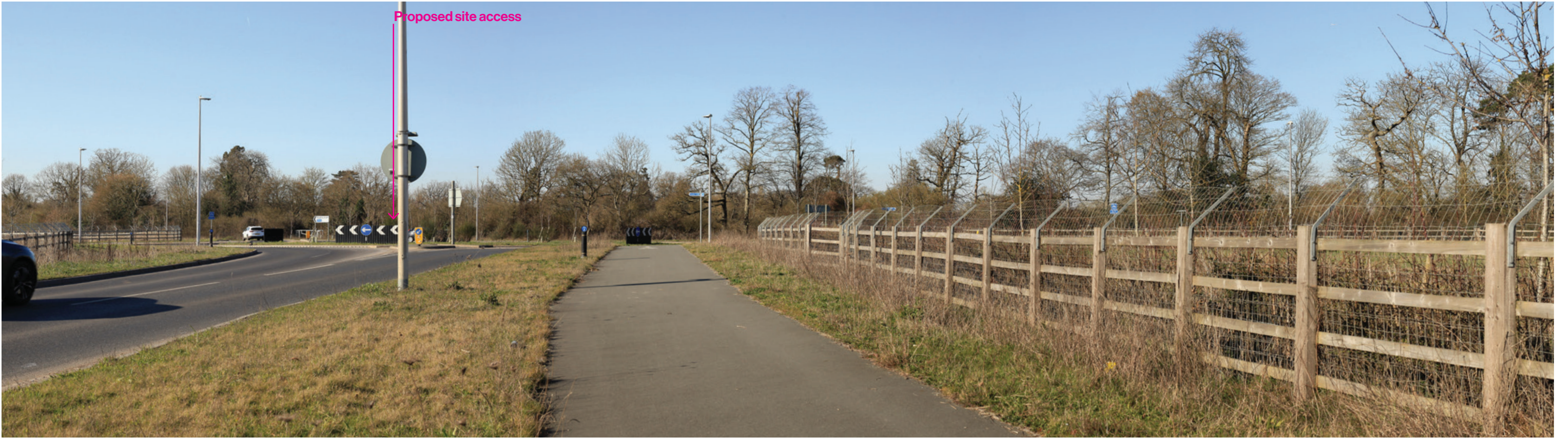
View 14: From A327, looking north. The southern access to the site would be via a new arm to this roundabout, resulting in the removal of some hedgerow. New homes would be glimpsed beyond, set beyond a green corridor adjacent to the site's southern boundary. Given the low value of the view and sensitivity of the visual receptors, the change to the view would not result in a significant adverse visual effect.