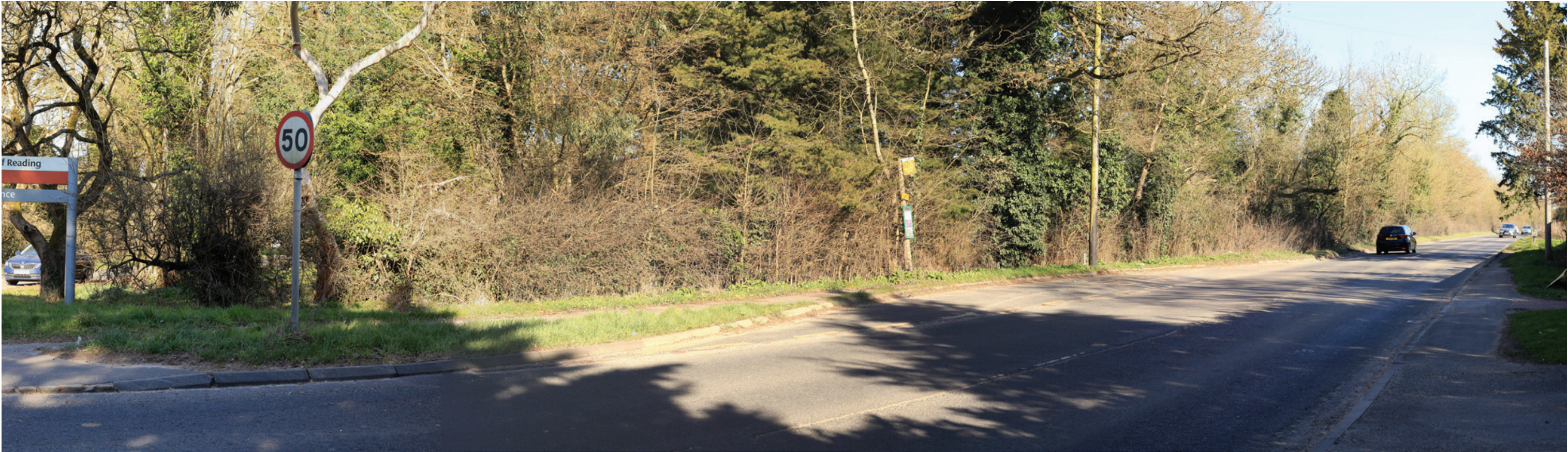
View 15: From A327 Reading Road, looking east. The site boundary benefits from a generous buffer of native hedgerow and trees which would be retained. Beyond this boundary there would be a large neighbourhood park, forming part of the wider proposed Eco Valley. This would provide further space and screening between users of the road and the new buildings.