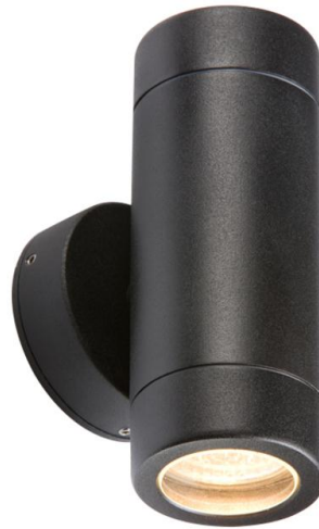
WALL2LBK GU10 Wall Mounted Fitting