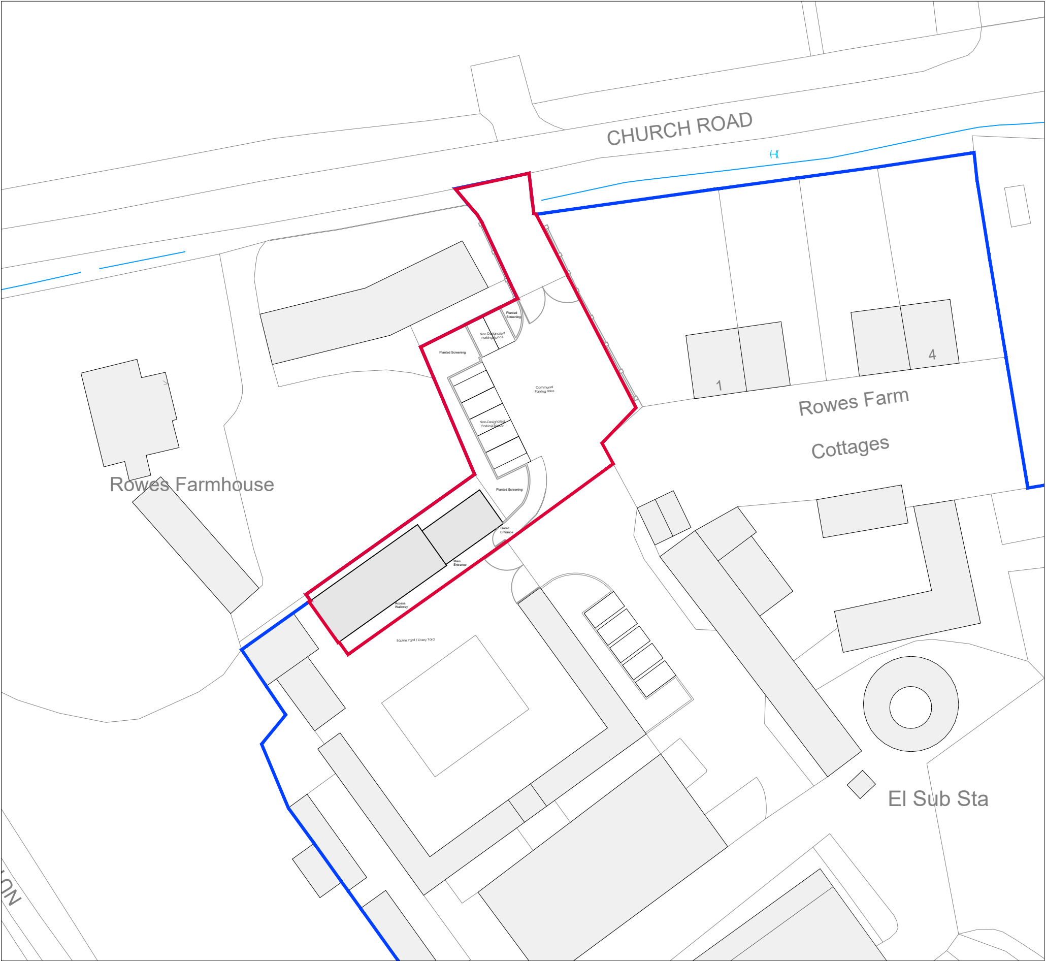
Site Block Plan Scale 1:500 @ A3

Site Development Boundary Wider Site Ownership Boundary