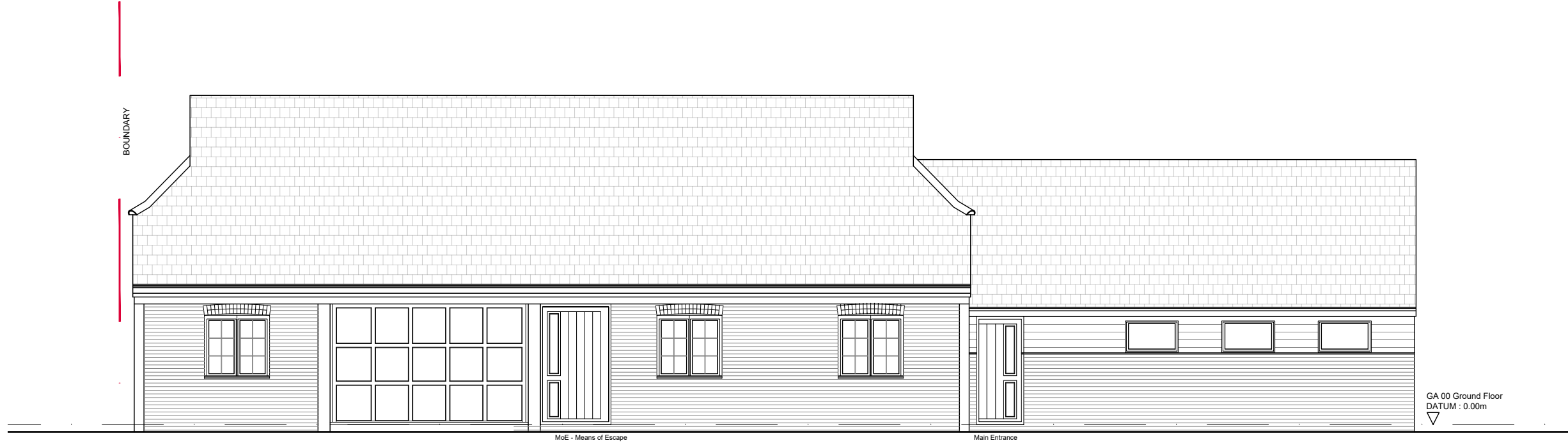
Existing South-East Elevation

Use figured dimensions only. Scale drawing only when a scale bar is present. All dimensions to be checked by user and any discrepancies, error or omissions to be reported to the architect before work commences. Read this drawing with all relevant materials.