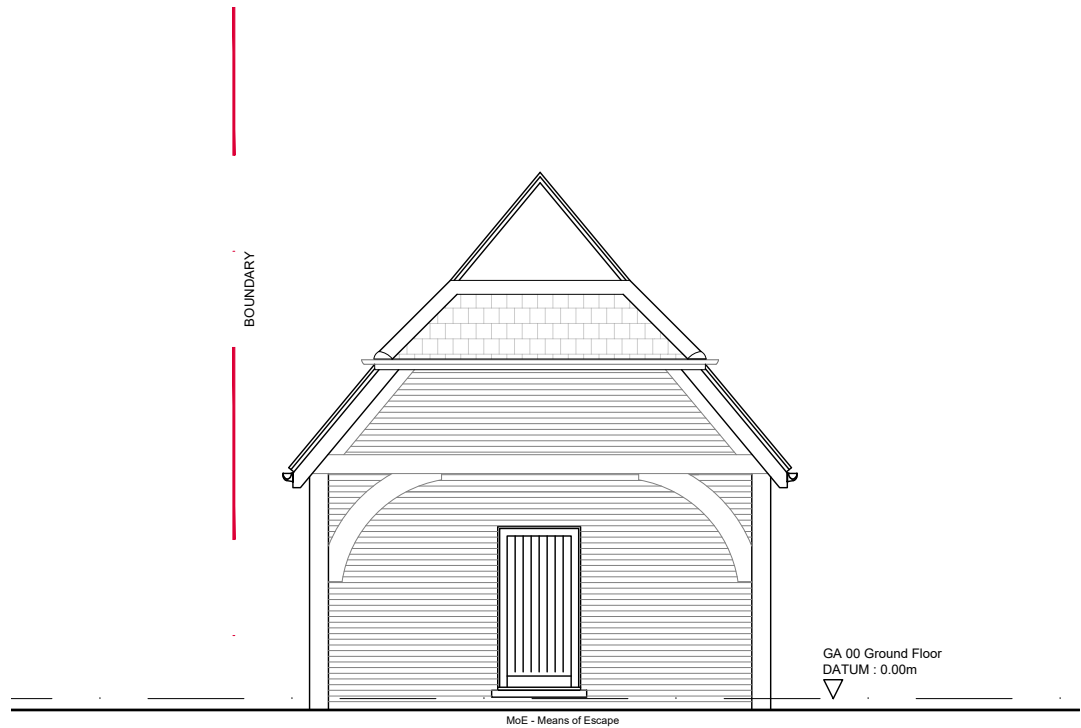
Existing South-West Elevation