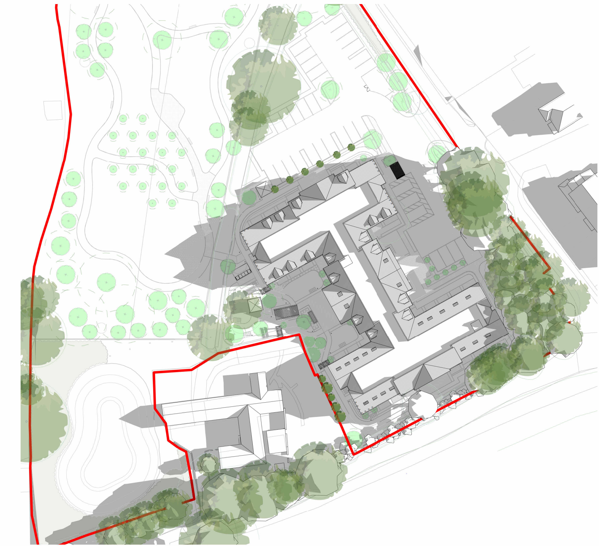
Solar Study - June 0700 hrs 1 : 600