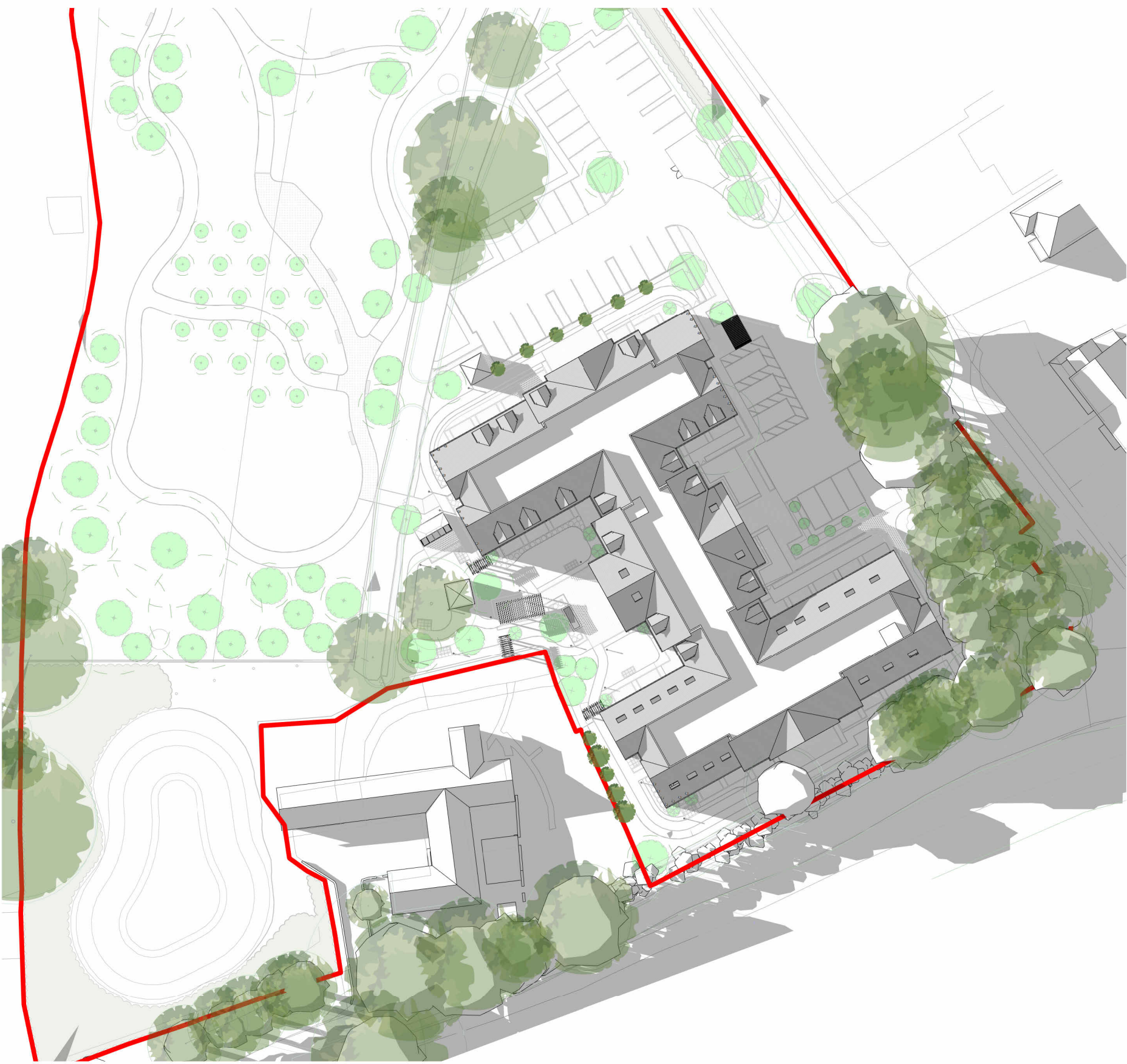
Solar Study - June 1800 hrs 1 : 600