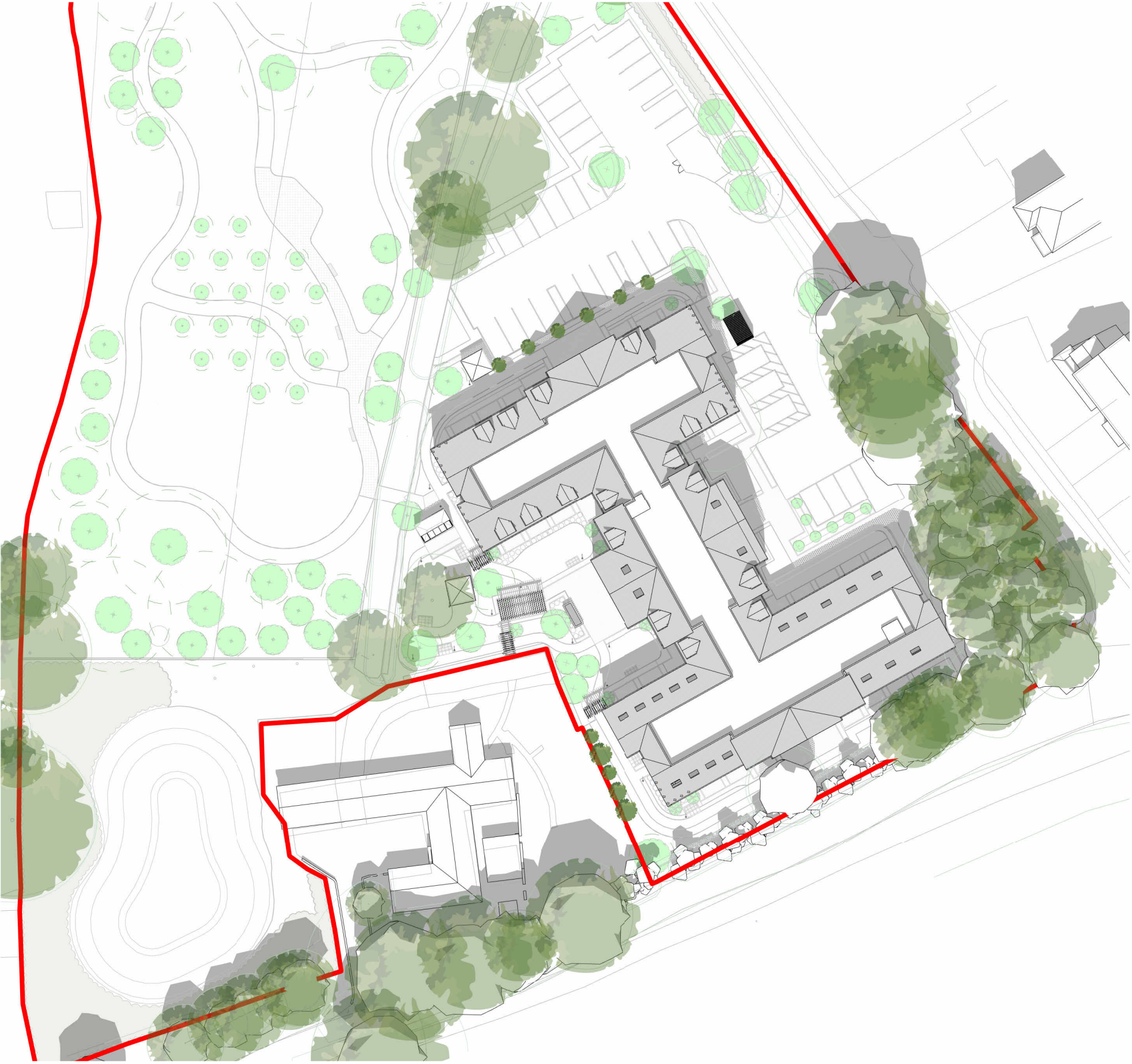
Solar Study - August 1200 hrs 1 : 600