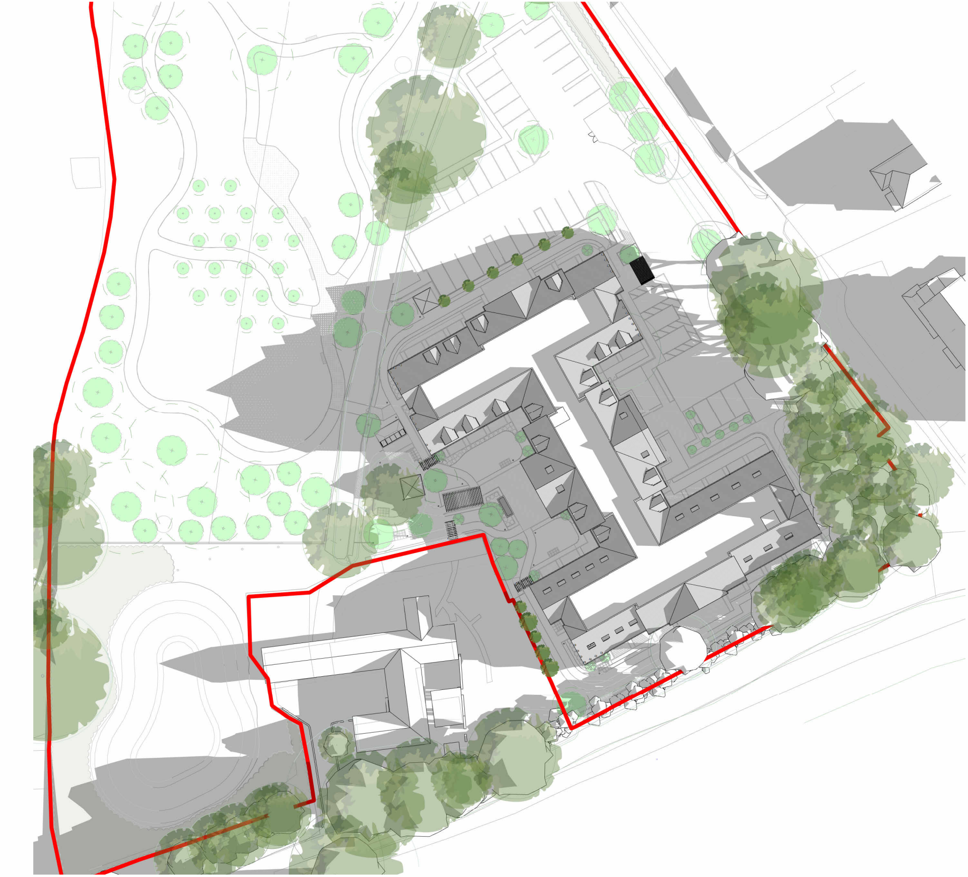
Solar Study - August 0700 hrs 1 : 600