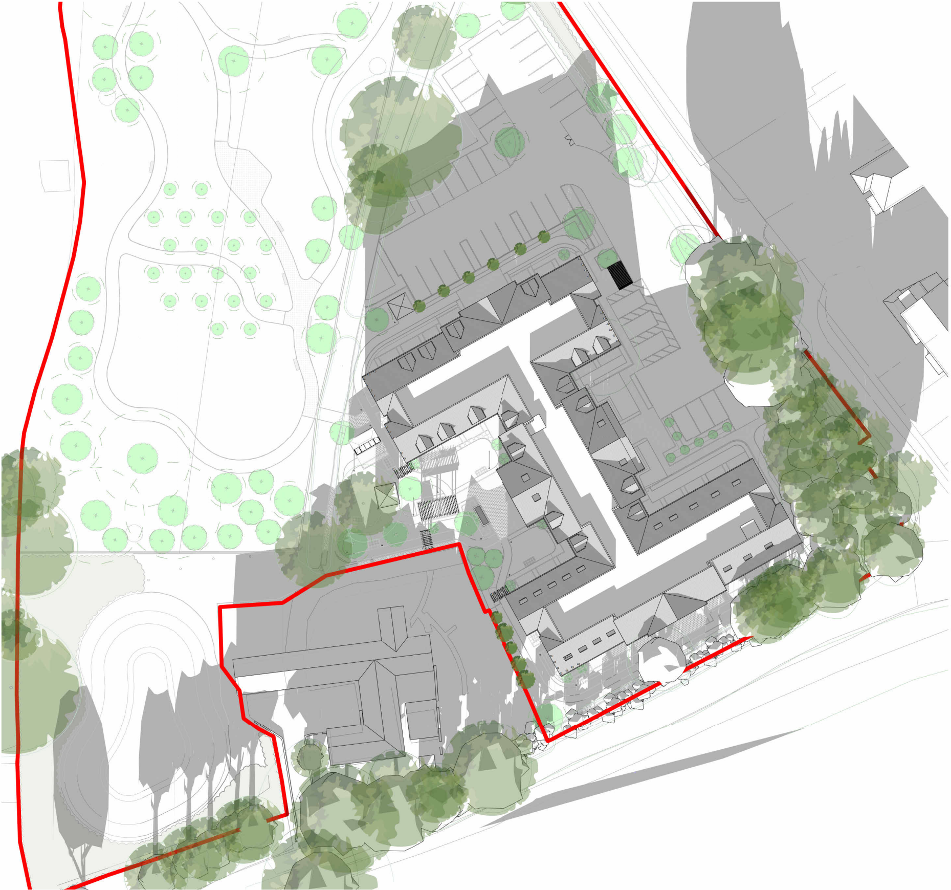
Solar Study - December 1200 hrs