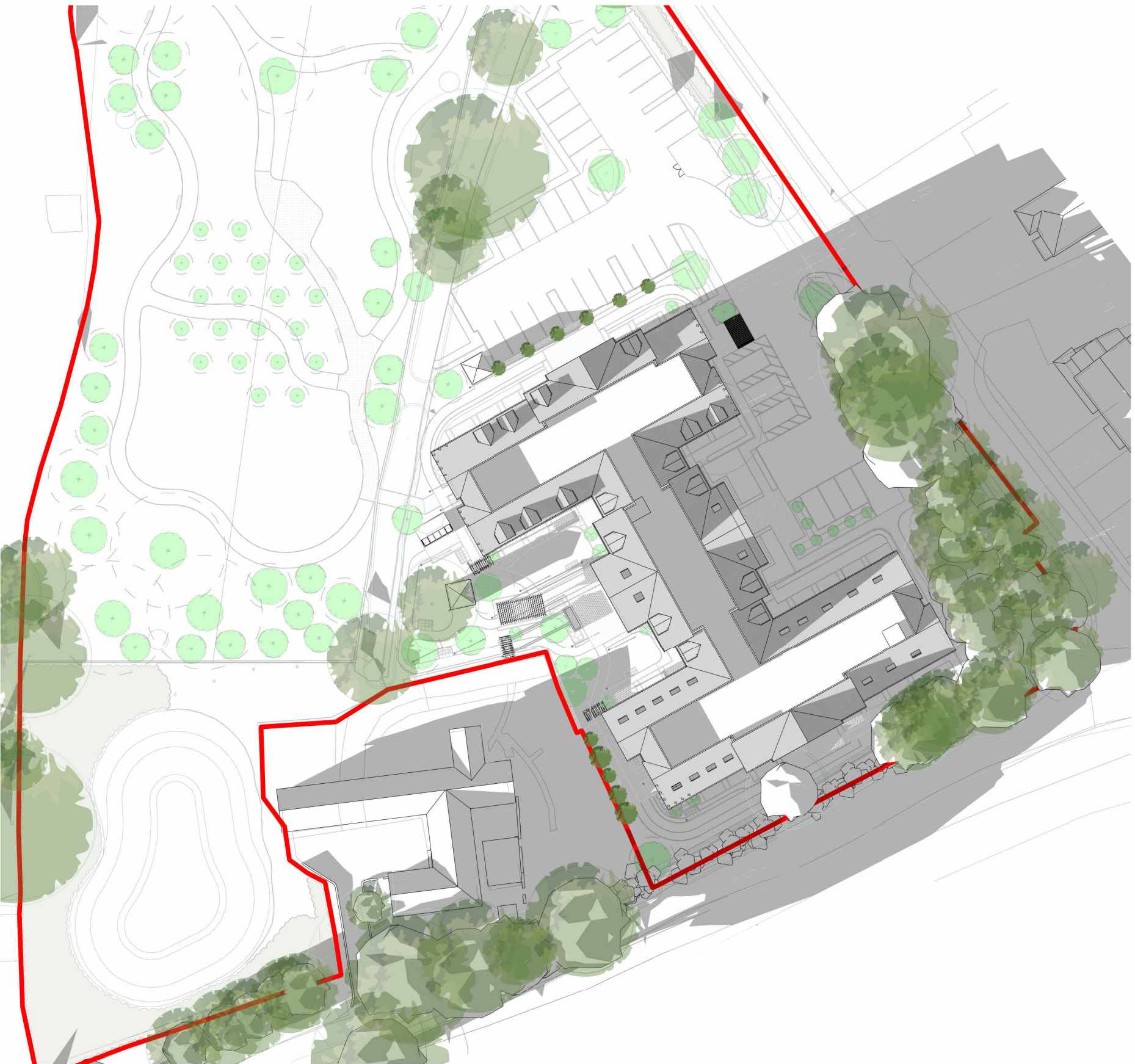
Solar Study - October 1600 hrs