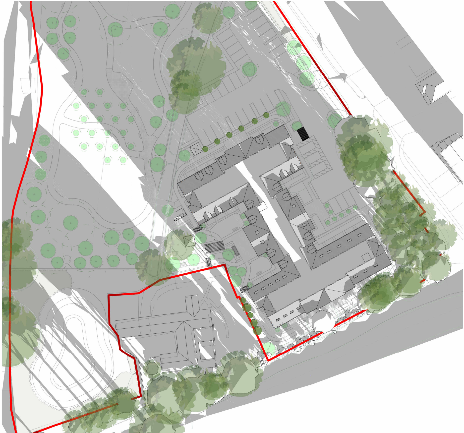
Solar Study - December 0900 hrs