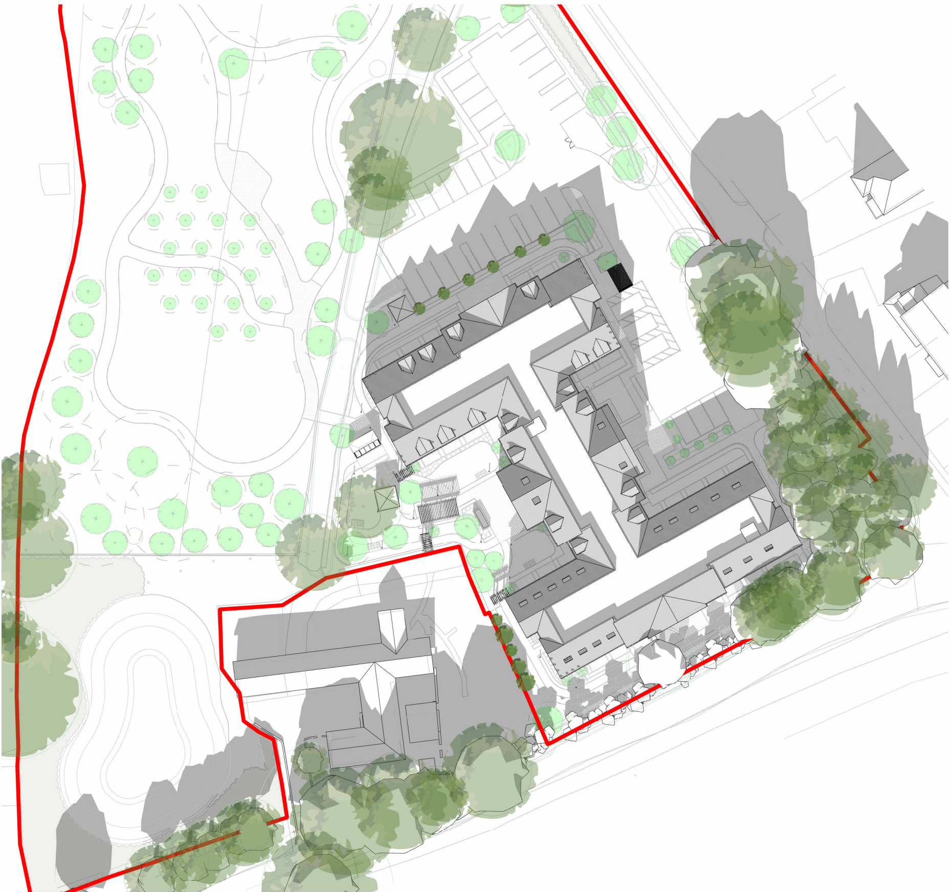
Solar Study - October 1200 hrs