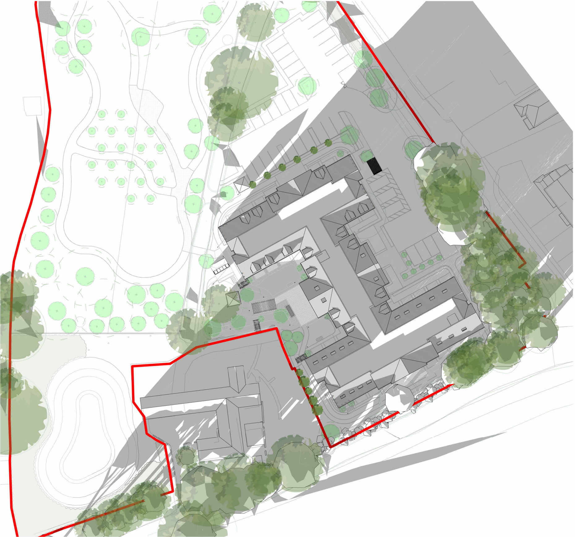
Solar Study - December 1500 hrs