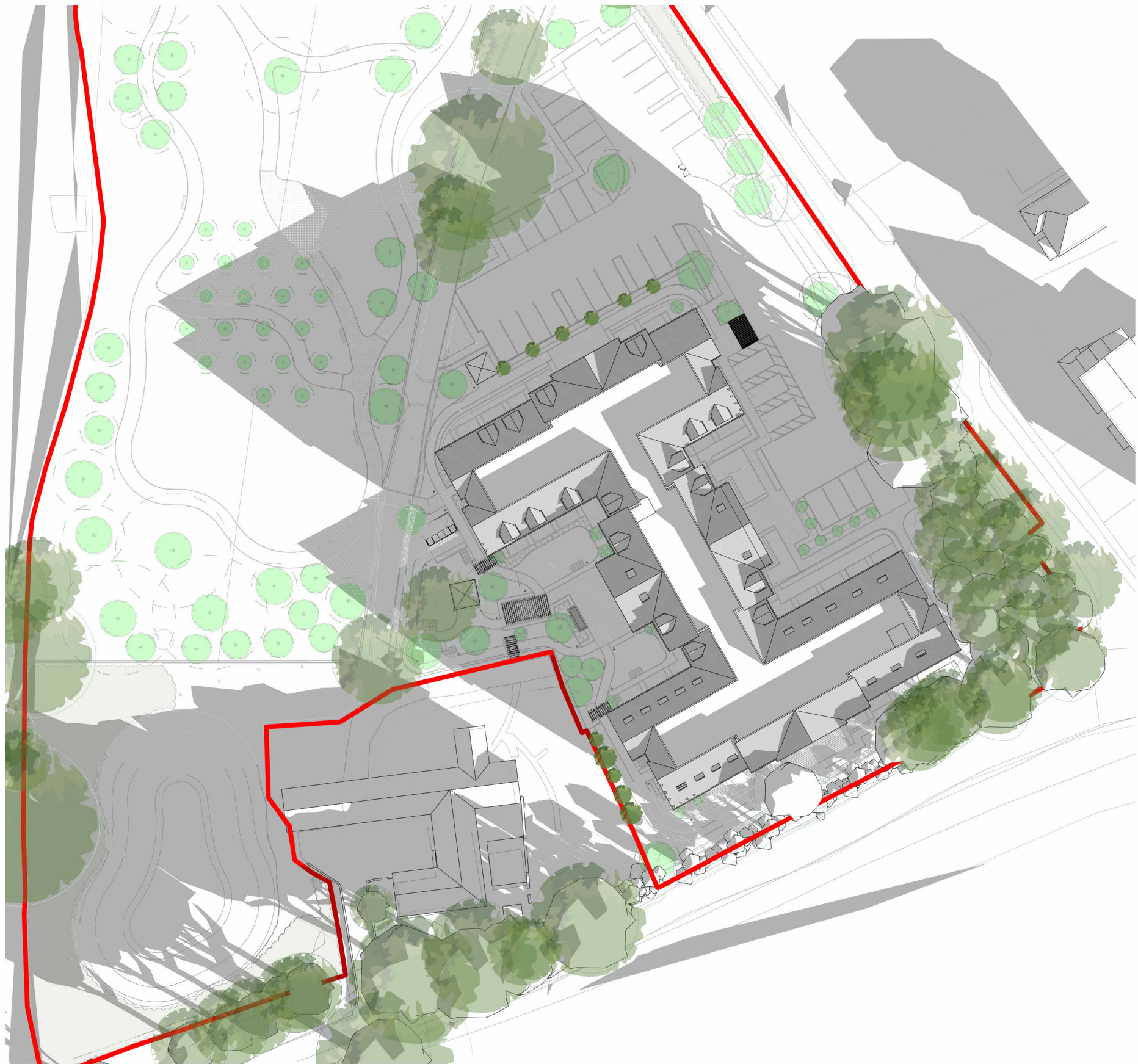
Solar Study - October 0800 hrs