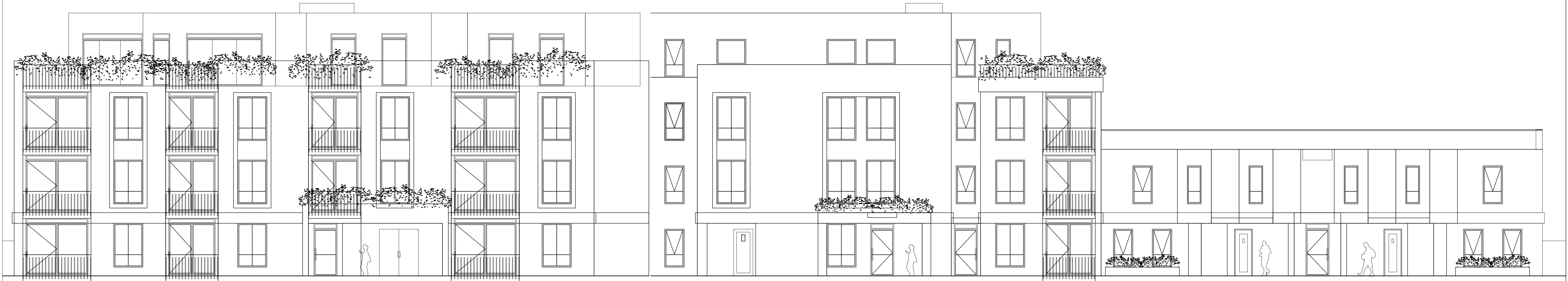
approved west elevation [A1 1:100]