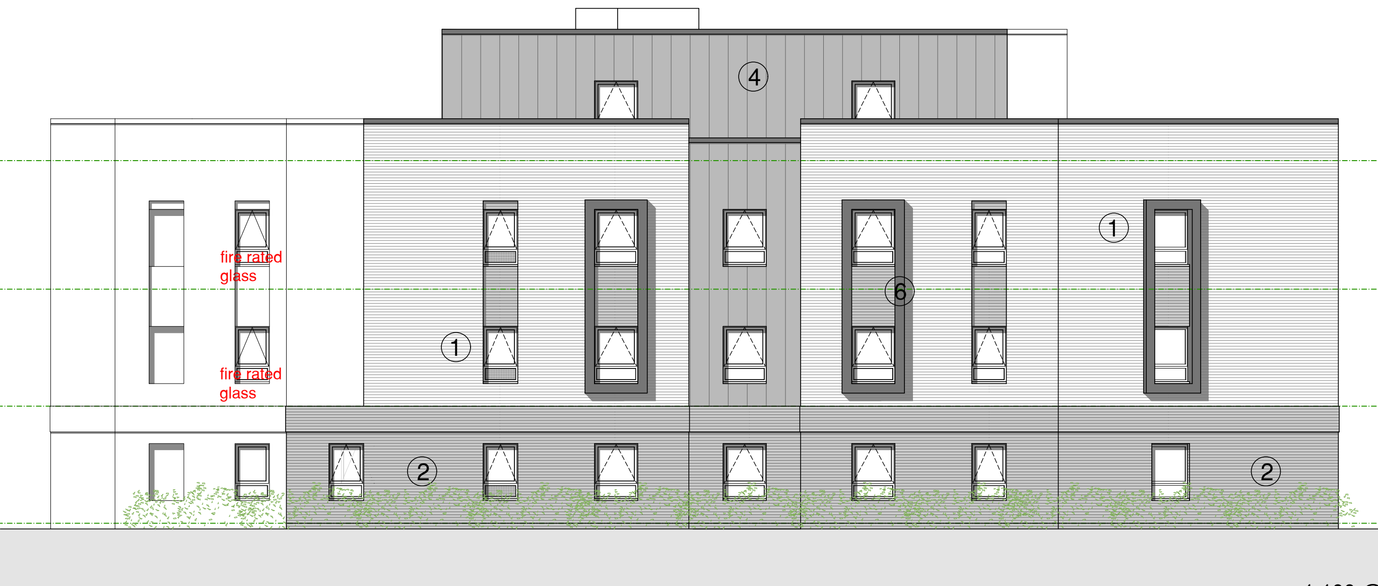
proposed north elevation [A1 1:100]