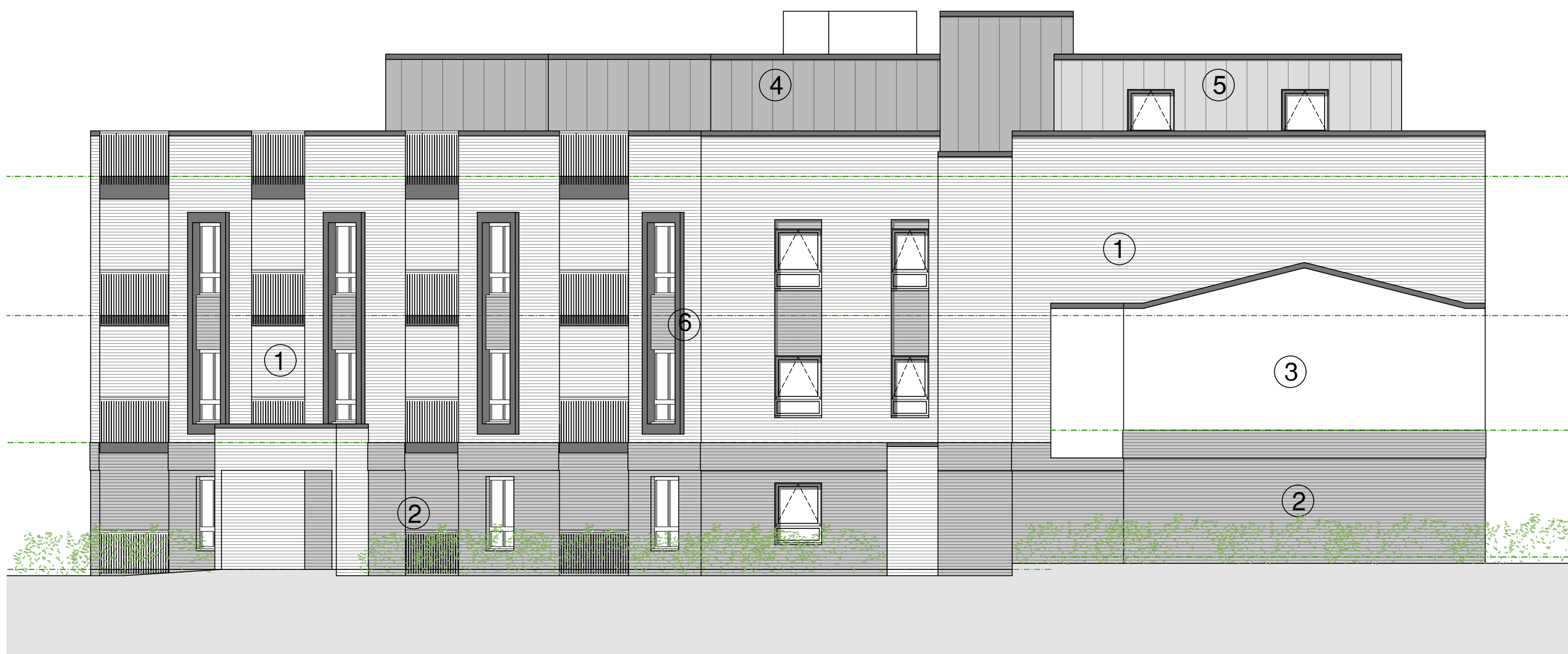
proposed south elevation [A1 1:100]