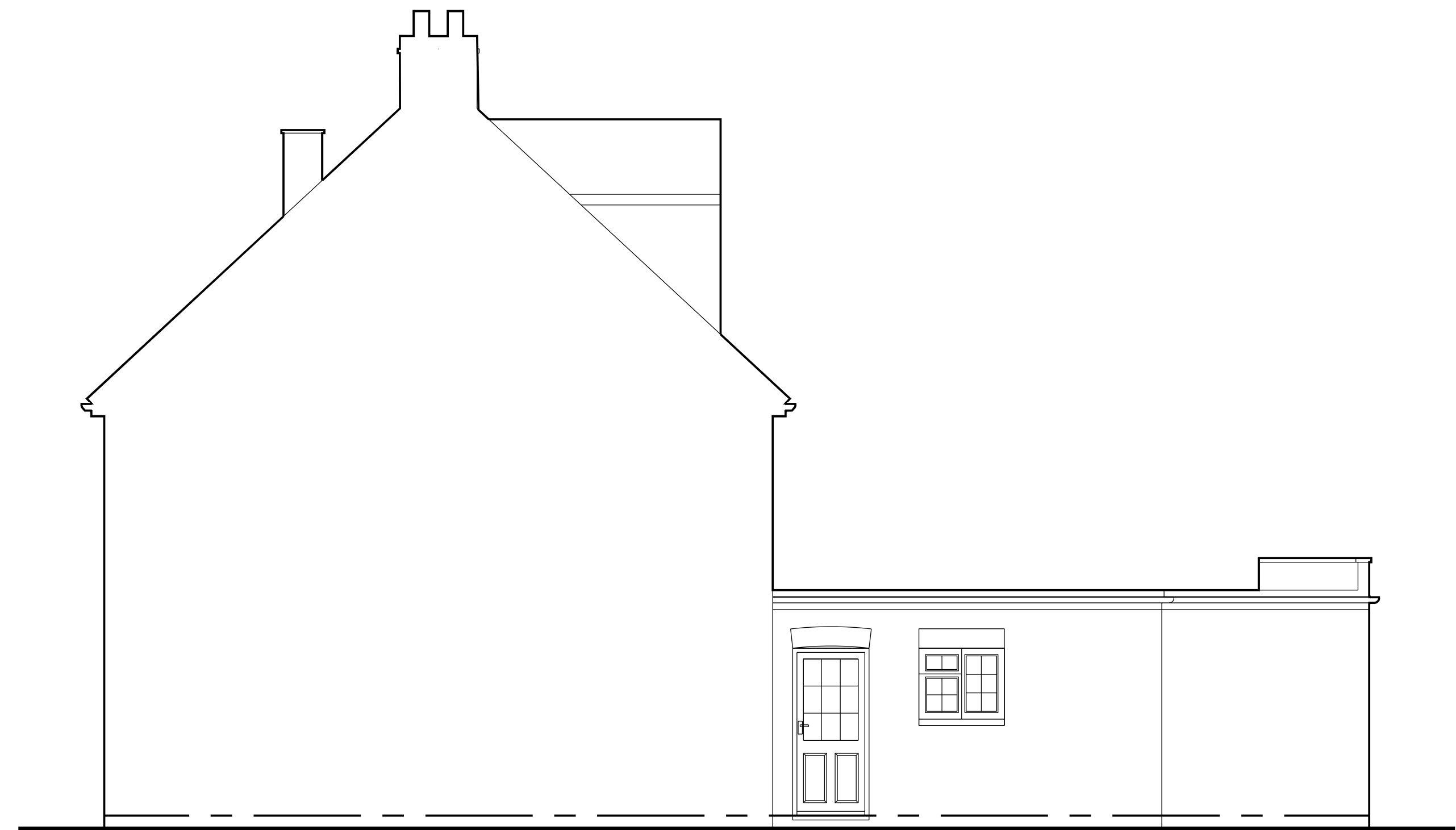
EXISTING SECTION AND EAST ELEVATION