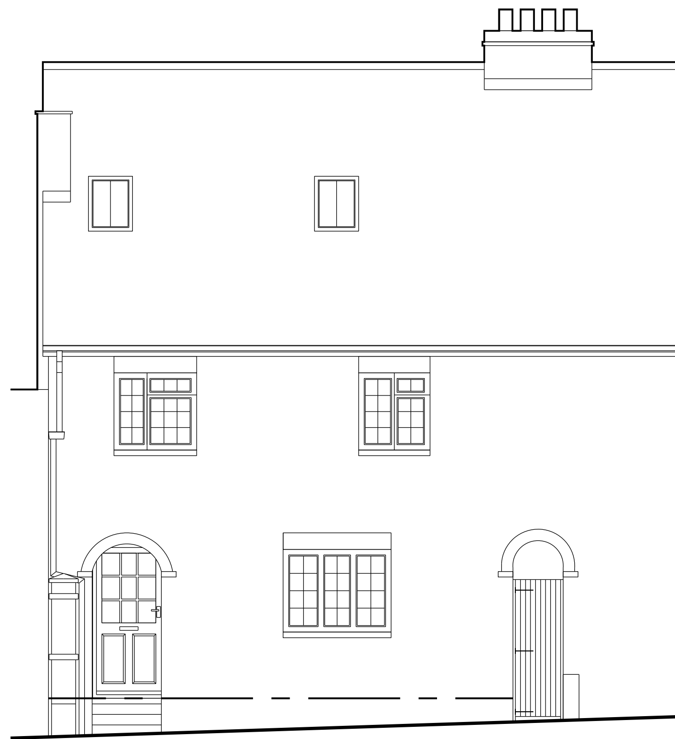
EXISTING FRONT ELEVATION SOUTH