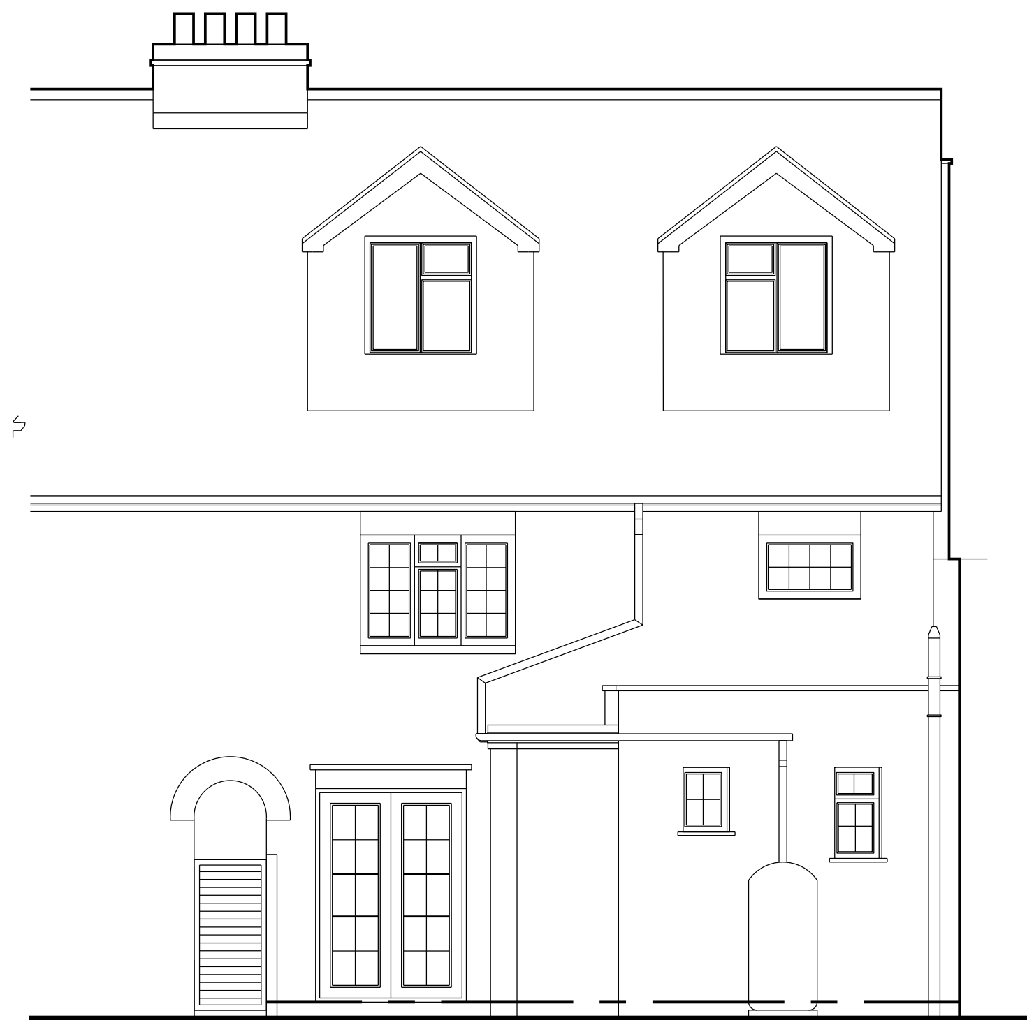
EXISTING REAR ELEVATION NORTH