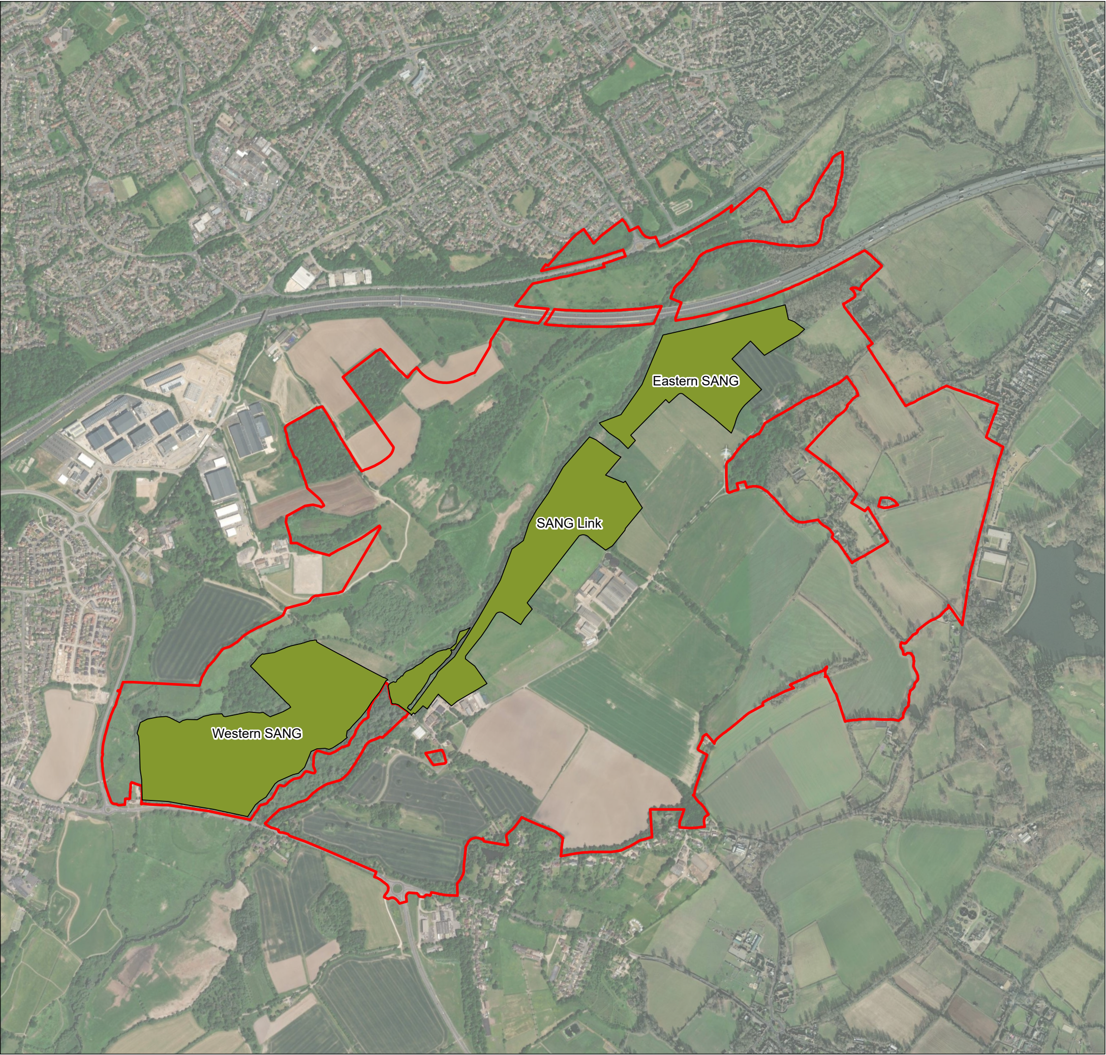
Map 11.17.2 Proposed SANG Location