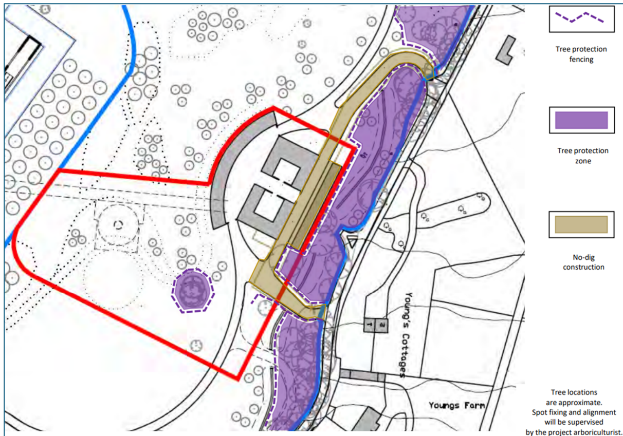
Fig 1. Revised protection measures around retained trees

Areas proposed for planting both within the application boundary for the Main House, as well as the application boundary for the Estate Management Building should also be fenced off during the groundworks and construction phase to limited damage to the ground and soil compaction.