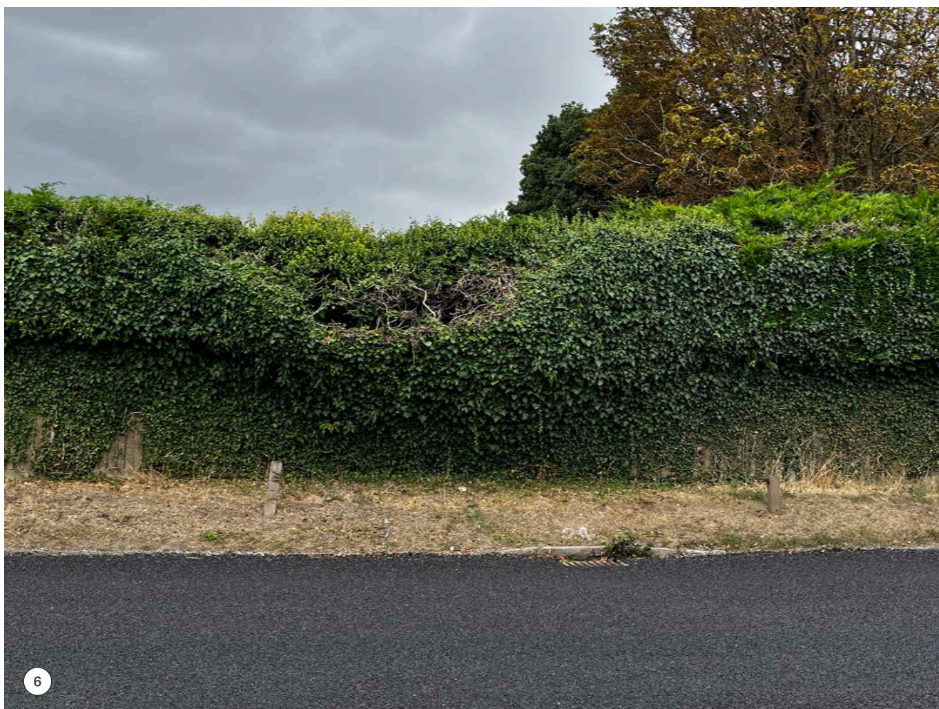
Culham Lane (Upper Culham Farm) No view possible