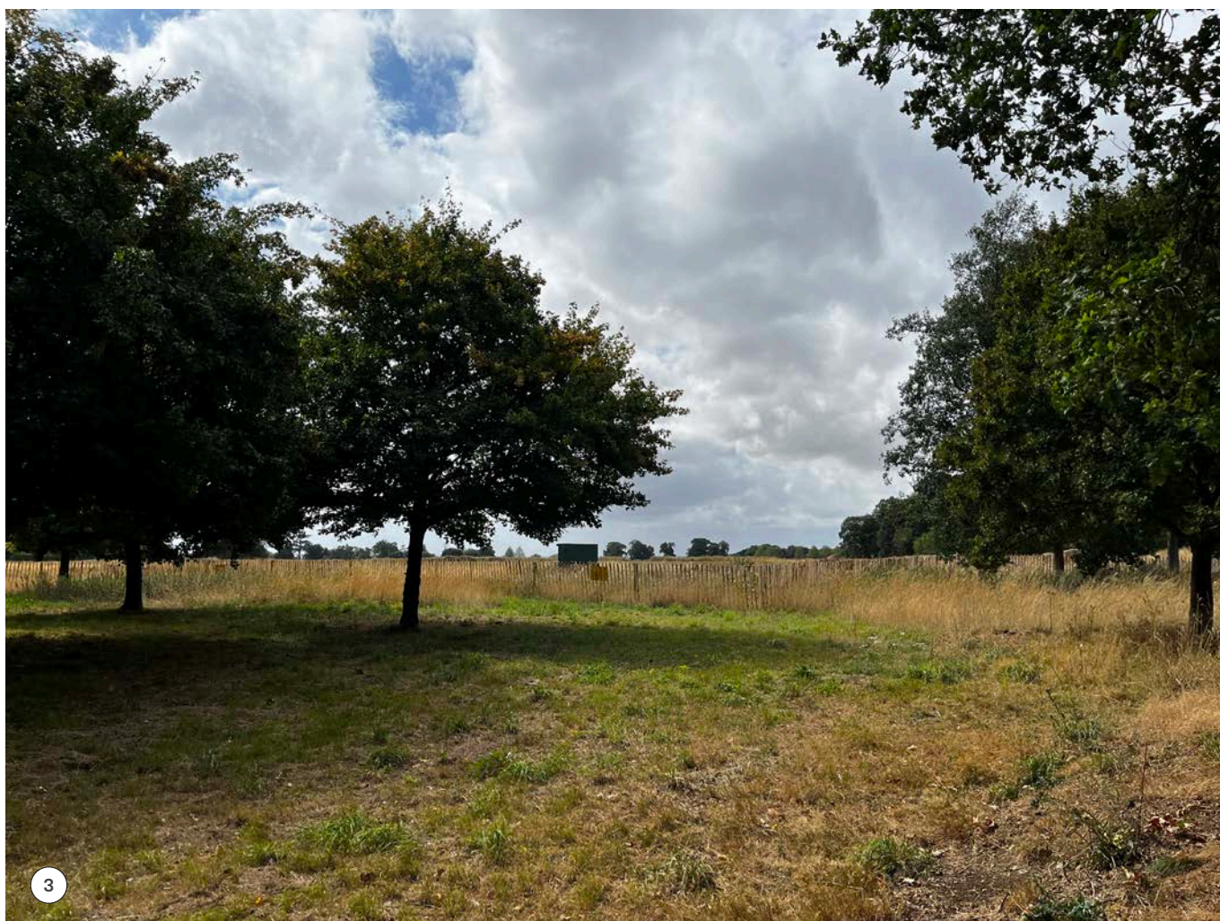
View southwards from inside plot (near to Wellhouse gate) No view possible