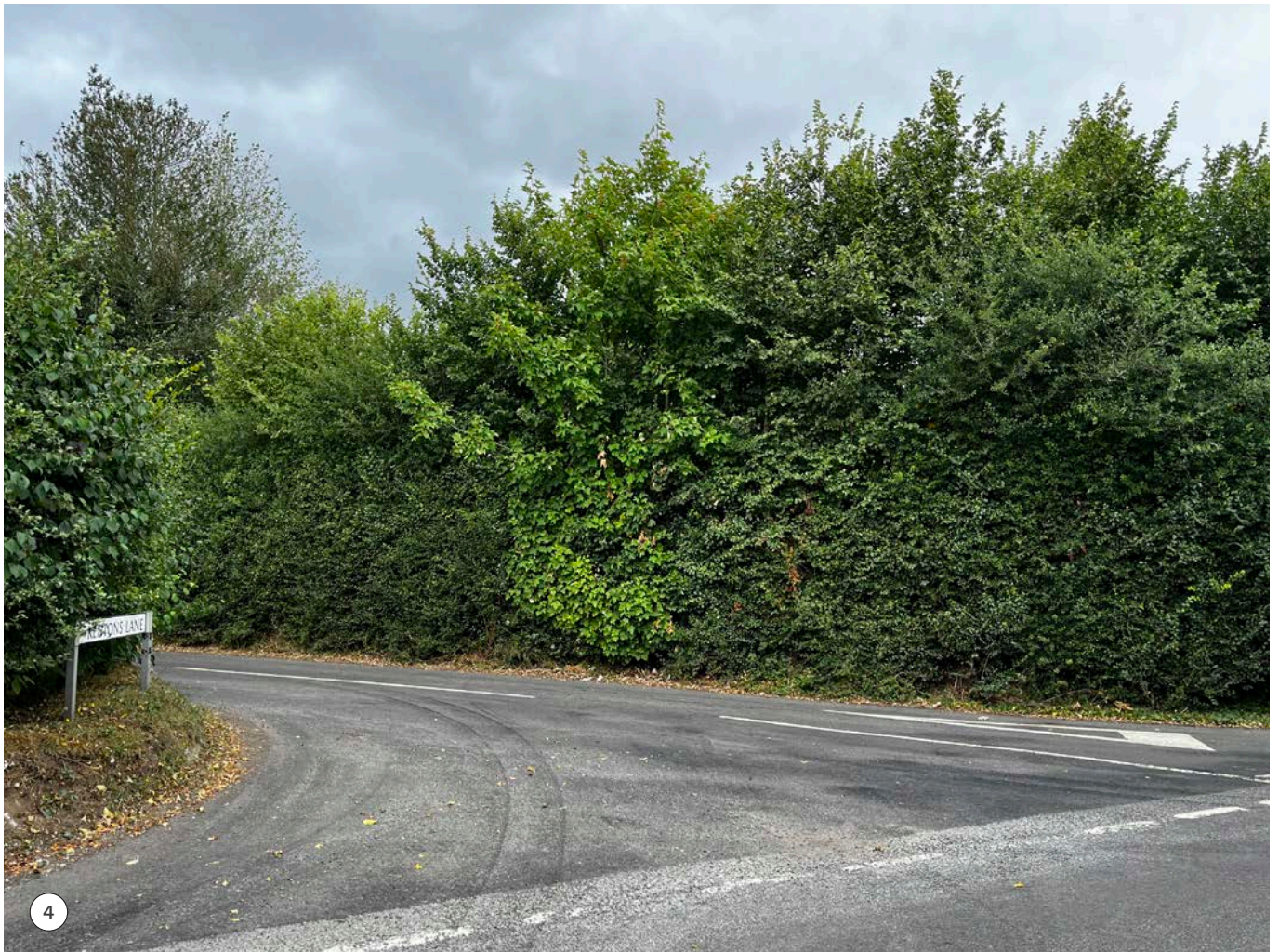
Junction of Kenton's Lane & Culham Lane No view possible