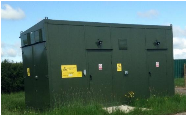
Plate 1: Example of a substation in Holly Green finish.