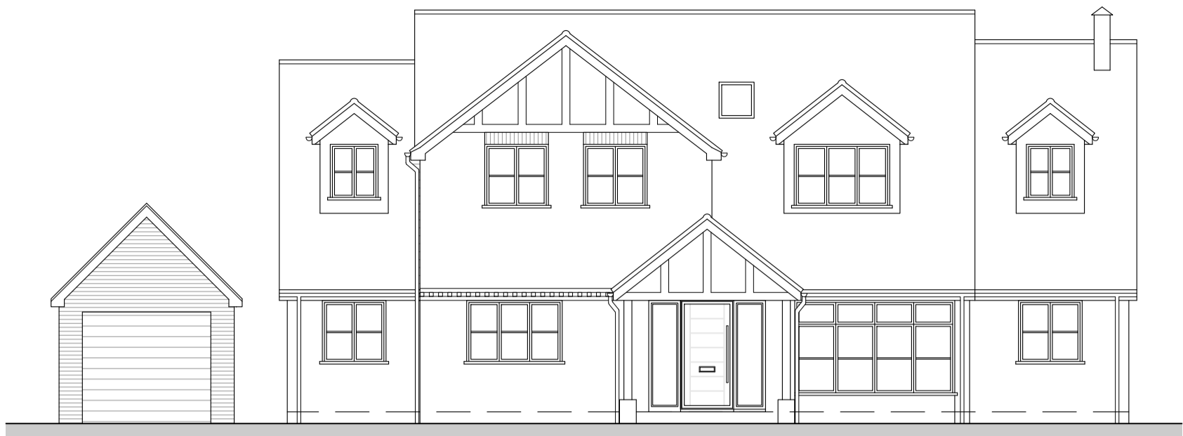
Front Elevation 1:100