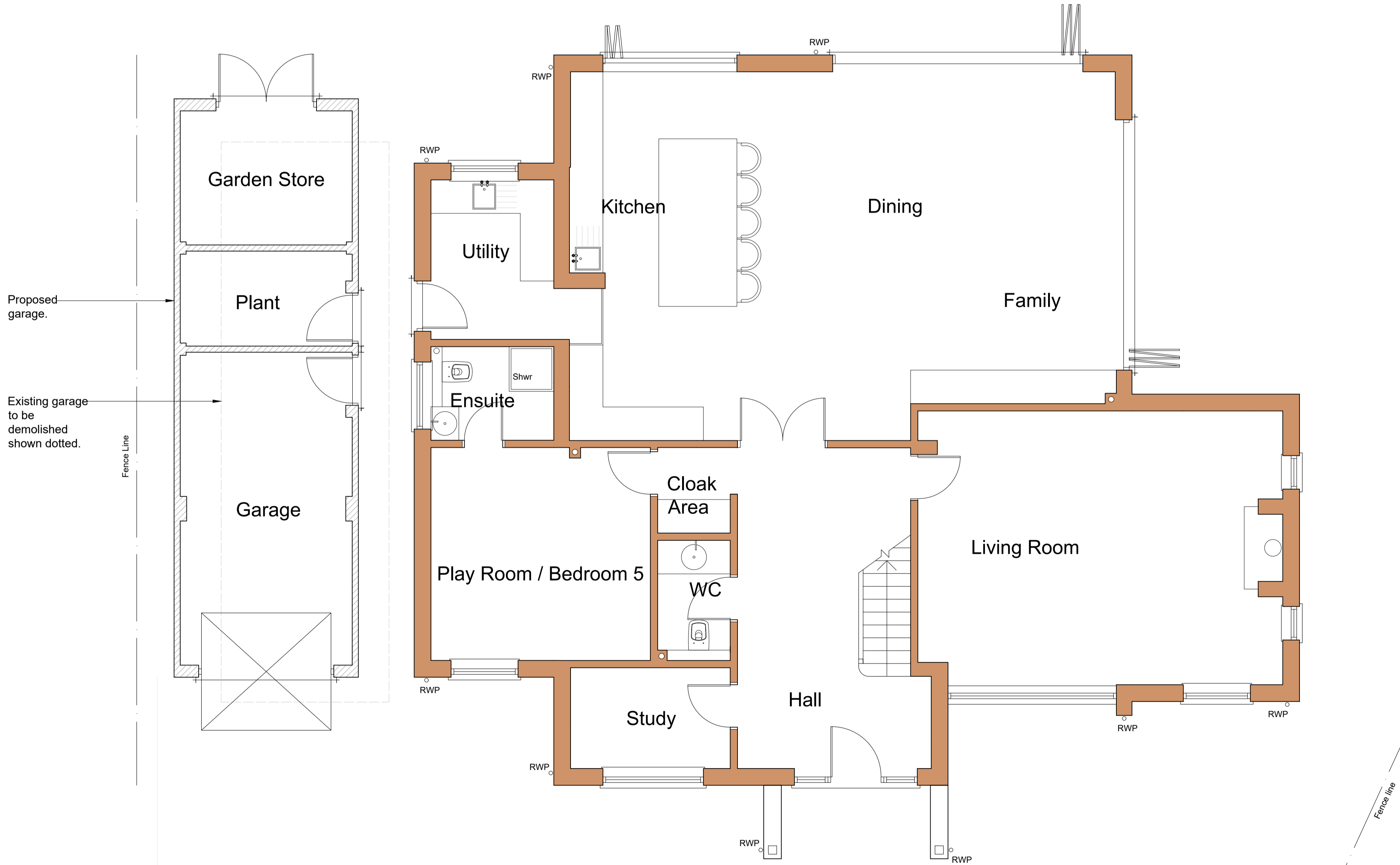
Ground Floor Plan 1:50