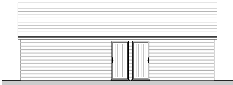
Side Elevation 1:100