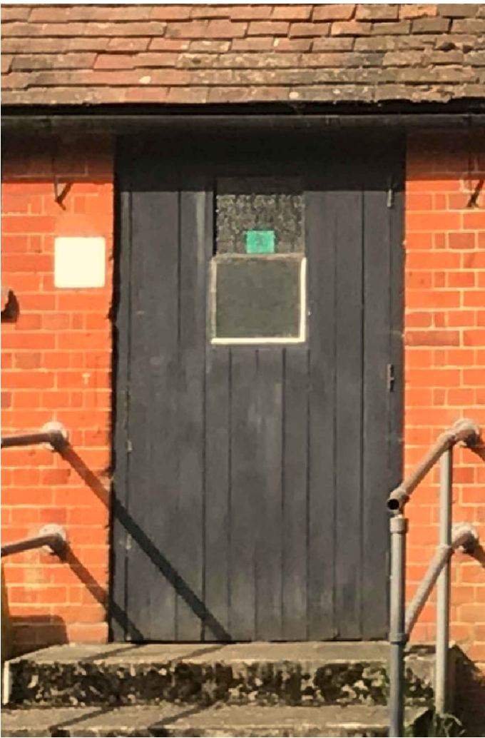
SITE PHOTO OF EXISTING SECONDARY DOOR

----- EXISTING STRUCTURE OR FITTINGS OR SERVICES TO BE REMOVED INDICATED THUS