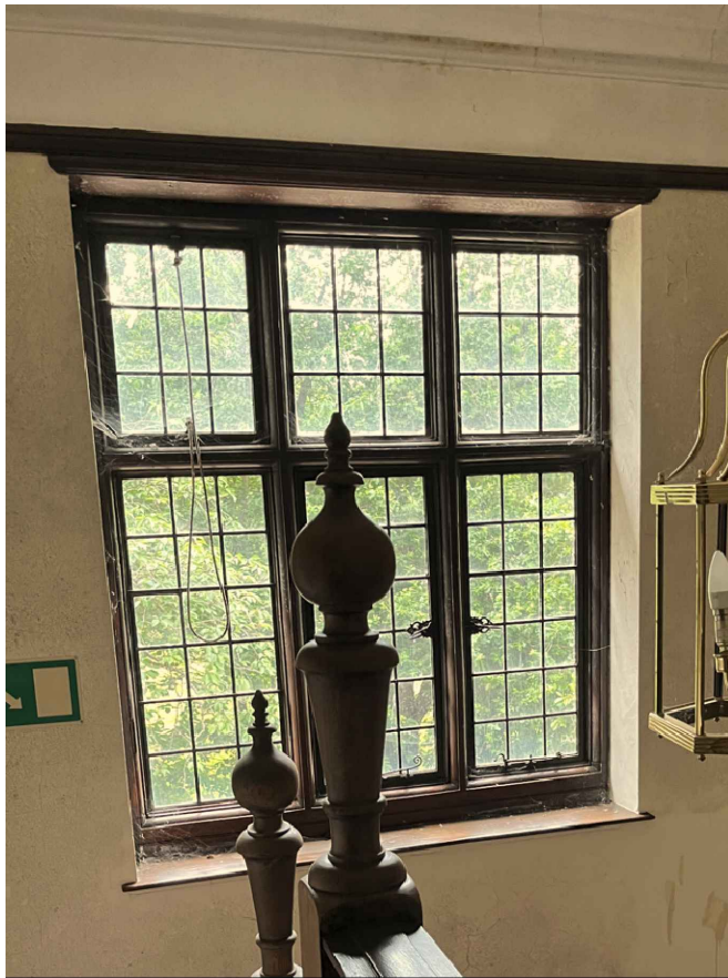
PHOTO OF EXISTING WINDOW FRAME