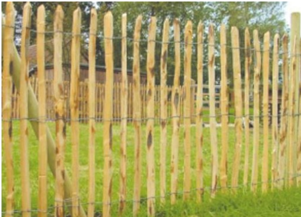
Fig. 3 Chestnut pale fencing in accordance with B.S. 5837 section 6.2.2.3

3.2.11 The position of the chestnut pale fencing is shown on the tree protection plan.