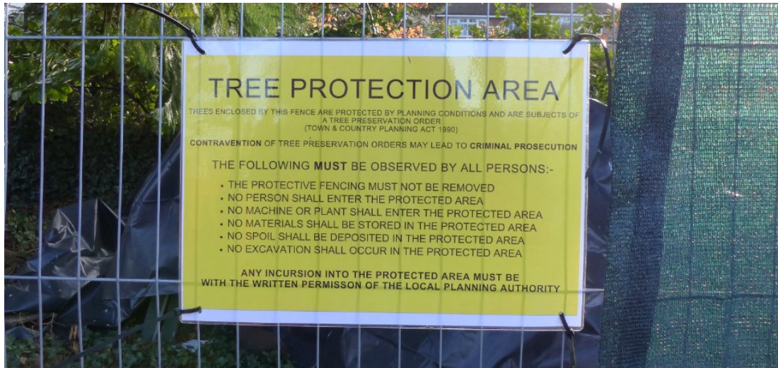
Fig 2. Signage attached to fencing reinforces the protection afforded by these barriers

3.2.11 The position of the chestnut pale fencing is shown on the tree protection plan.