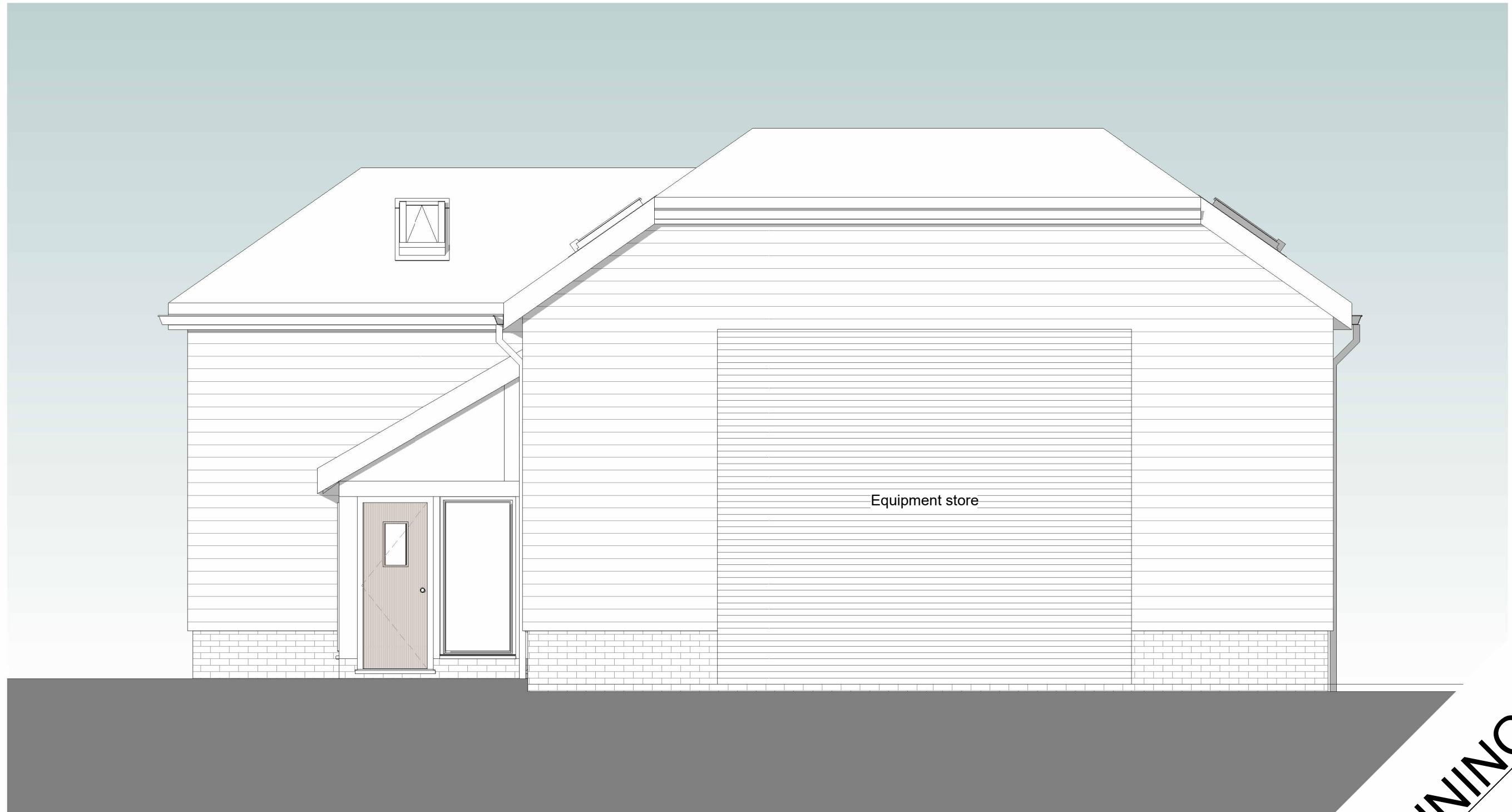
4 North West Elevation 1 : 50

Broadacre Place, Broad Common Road, Hurst