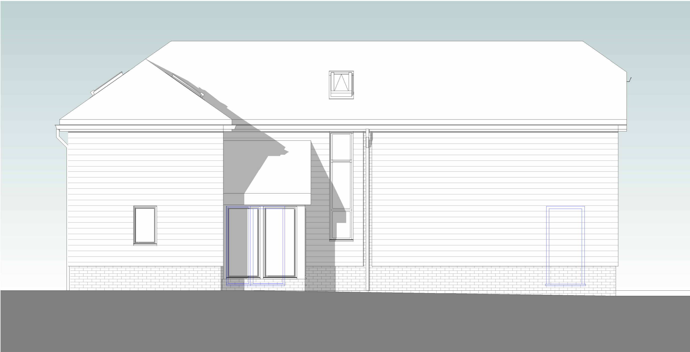
1 North East Elevation 1 : 50