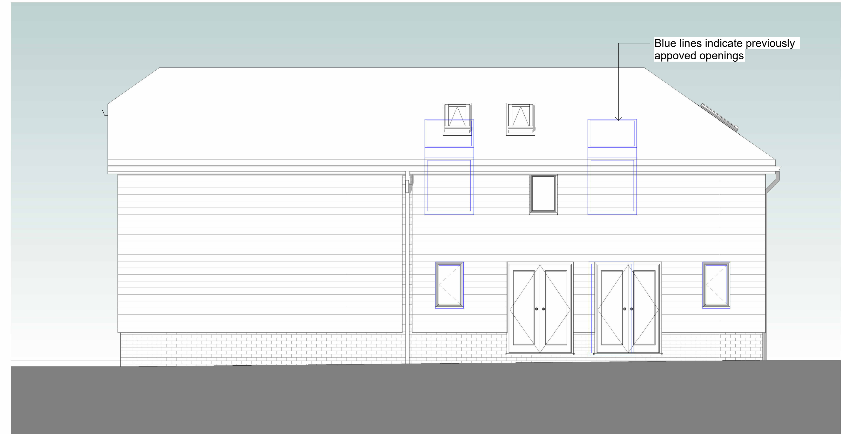
3 South West Elevation 1 : 50