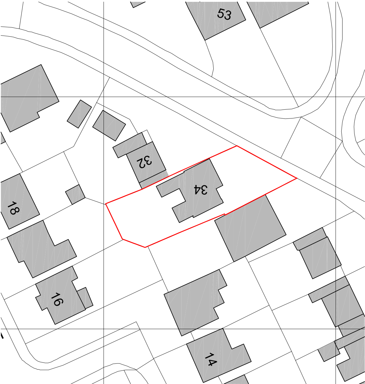
Block Plan - As Existing Scale: 1:500

All dimensions are to be checked on site before work commences. Figured dimensions to be taken in preference to scaled dimensions. If in doubt please ask. © Copyright reserved.