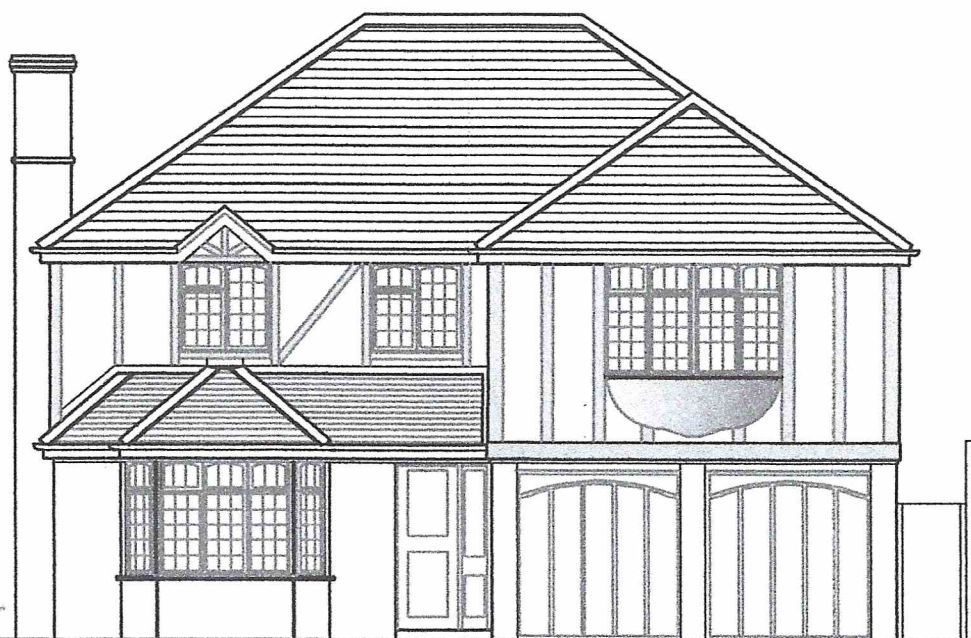
Front elevation (existing)

ALL WORKS ARE INTEGRAL TO THE HOUSE AND DO NOT AFFECT ROOF SPACES THERE ARE NO IMPACTS TO PROTECTED SPECIES AS PART OF THE GARAGE CONVERSION AS A RESULT