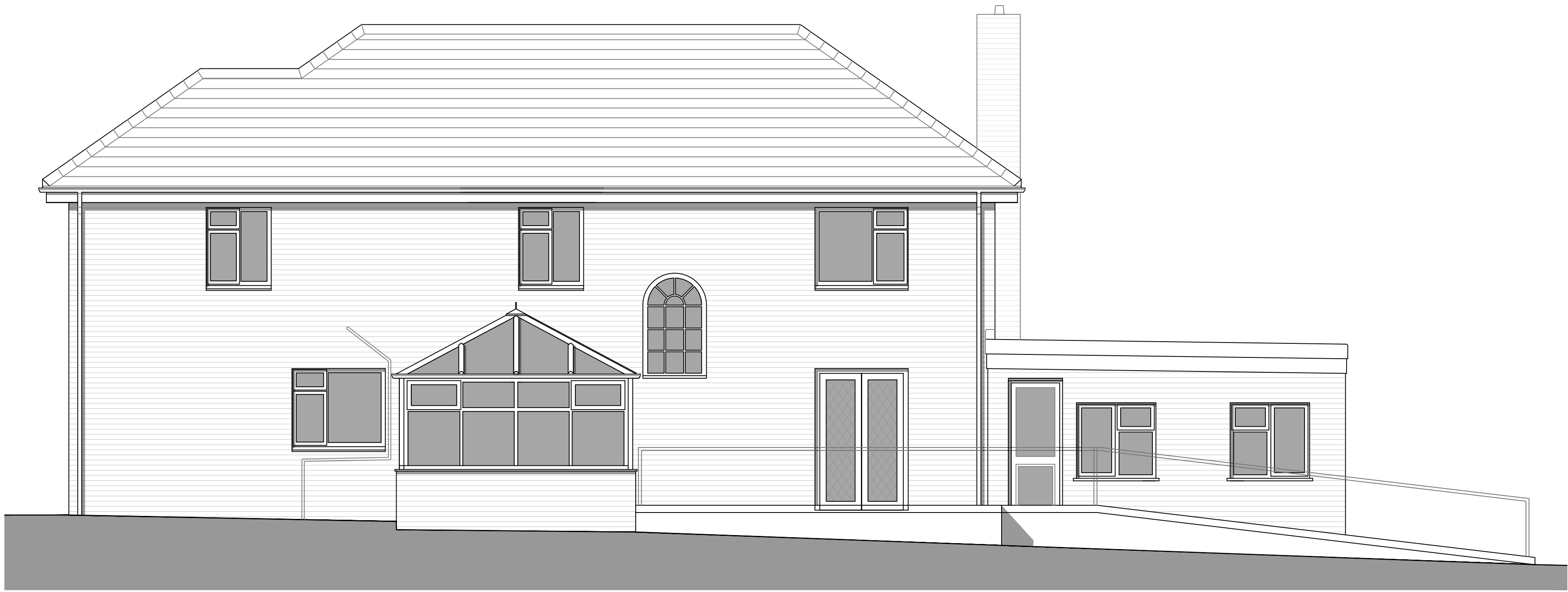
Rear Elevation (North)