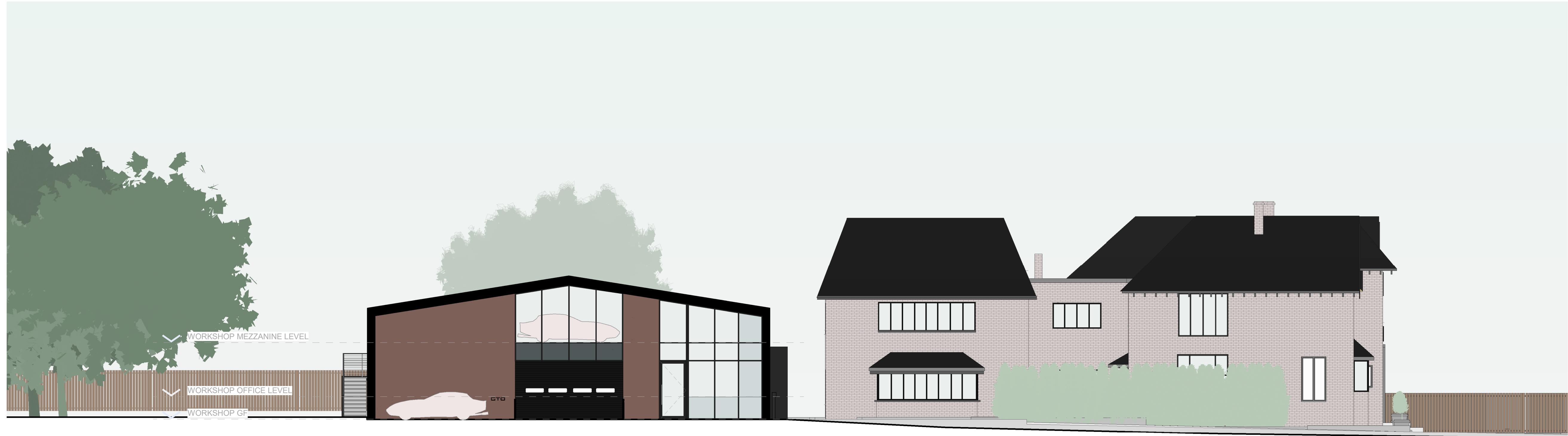
4 WEST ELEVATION - PROPOSED