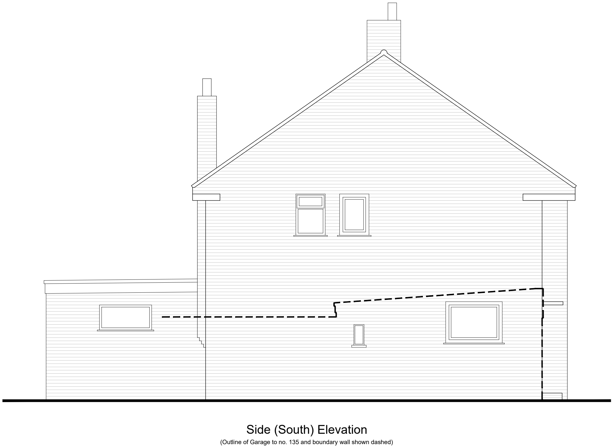
Side (South) Elevation (Outline of Garage to no. 135 and boundary wall shown dashed)