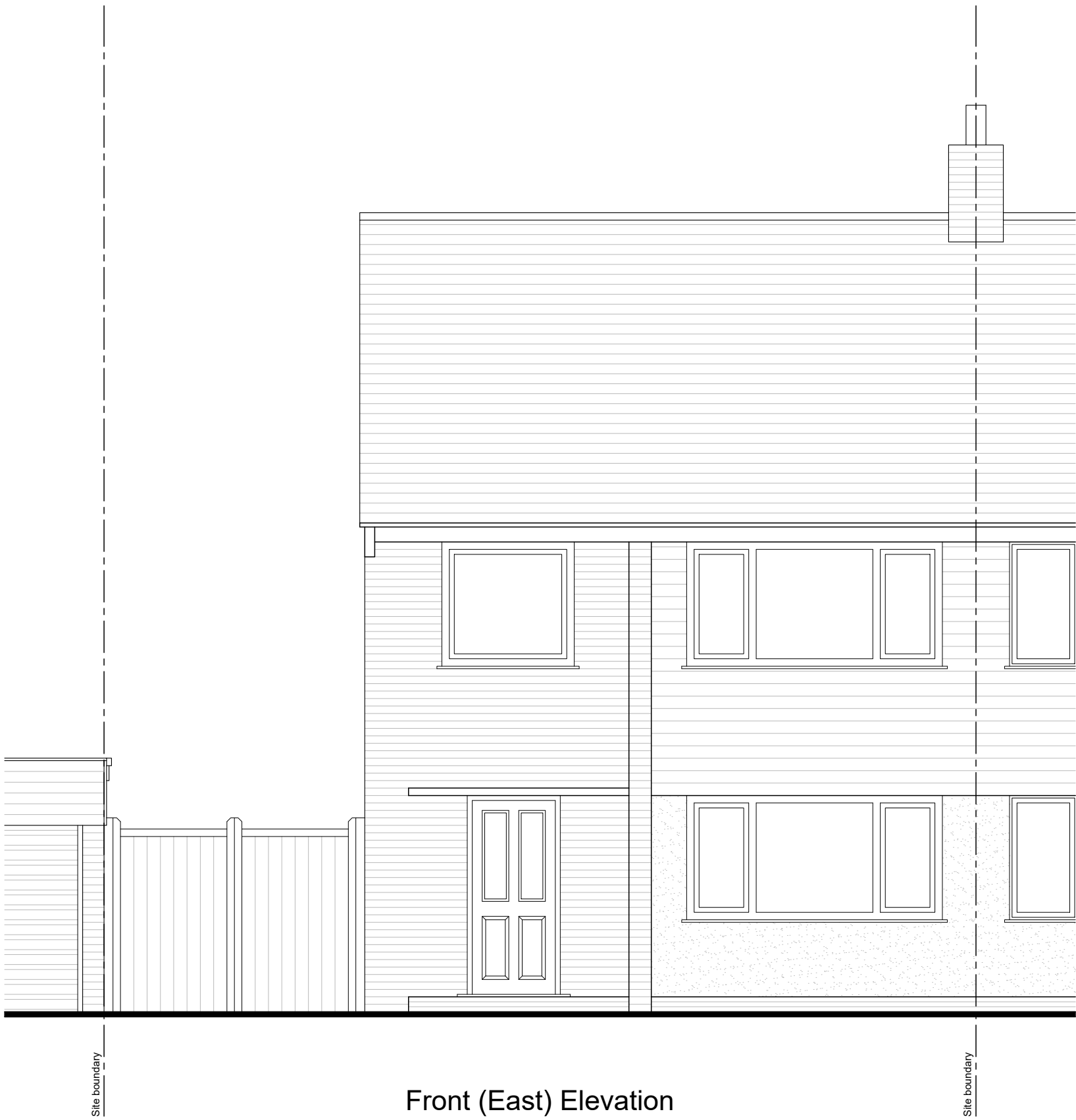
Front (East) Elevation

Notes This drawing may not be reproduced in any part or form without the written consent of DOHarchitecture. This drawing is to be read in conjunction with the other drawing(s) and specification(s). Do not scale from this drawing, except for Planning purposes. All dimensions are to be checked on site.