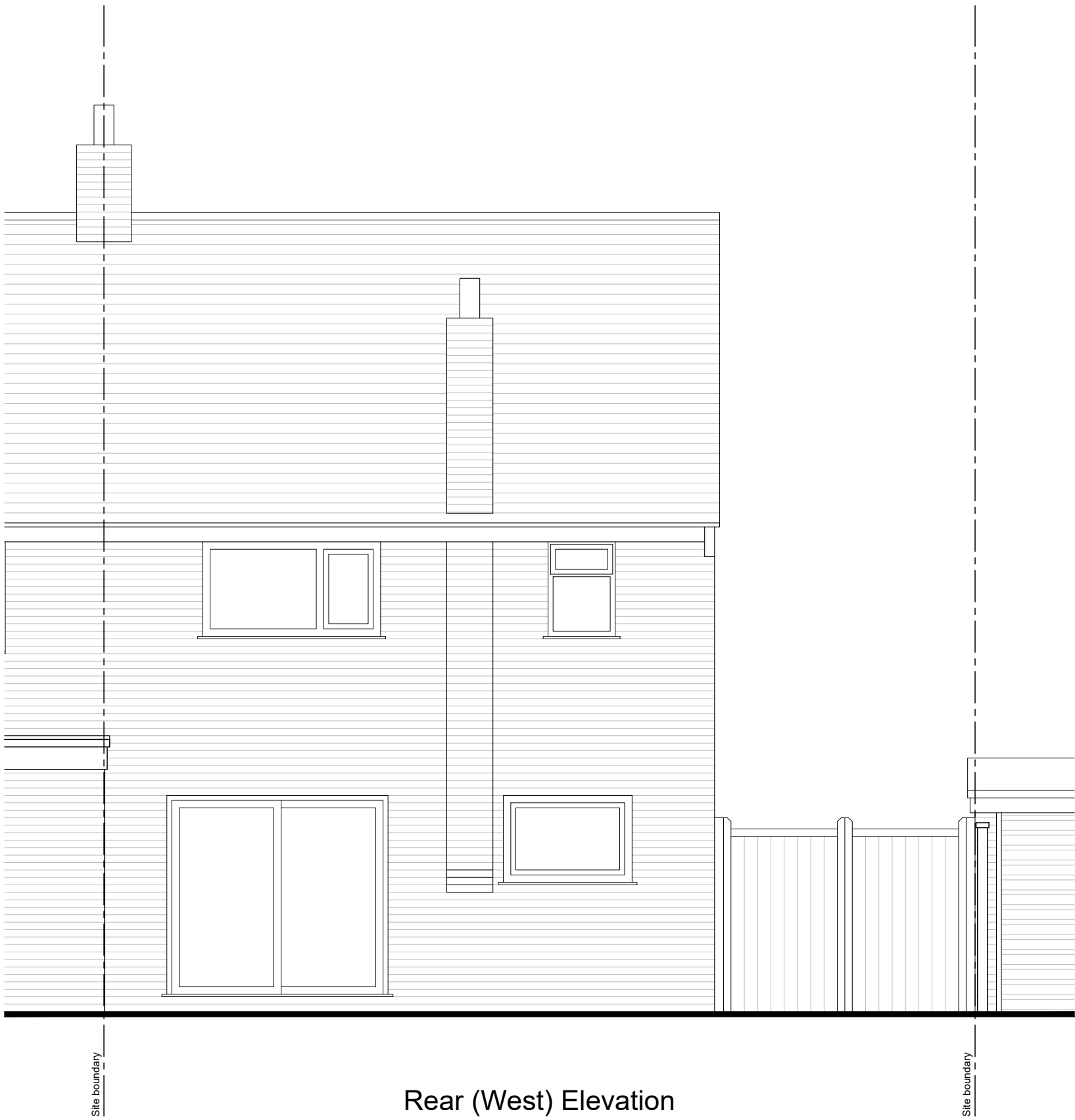
Rear (West) Elevation