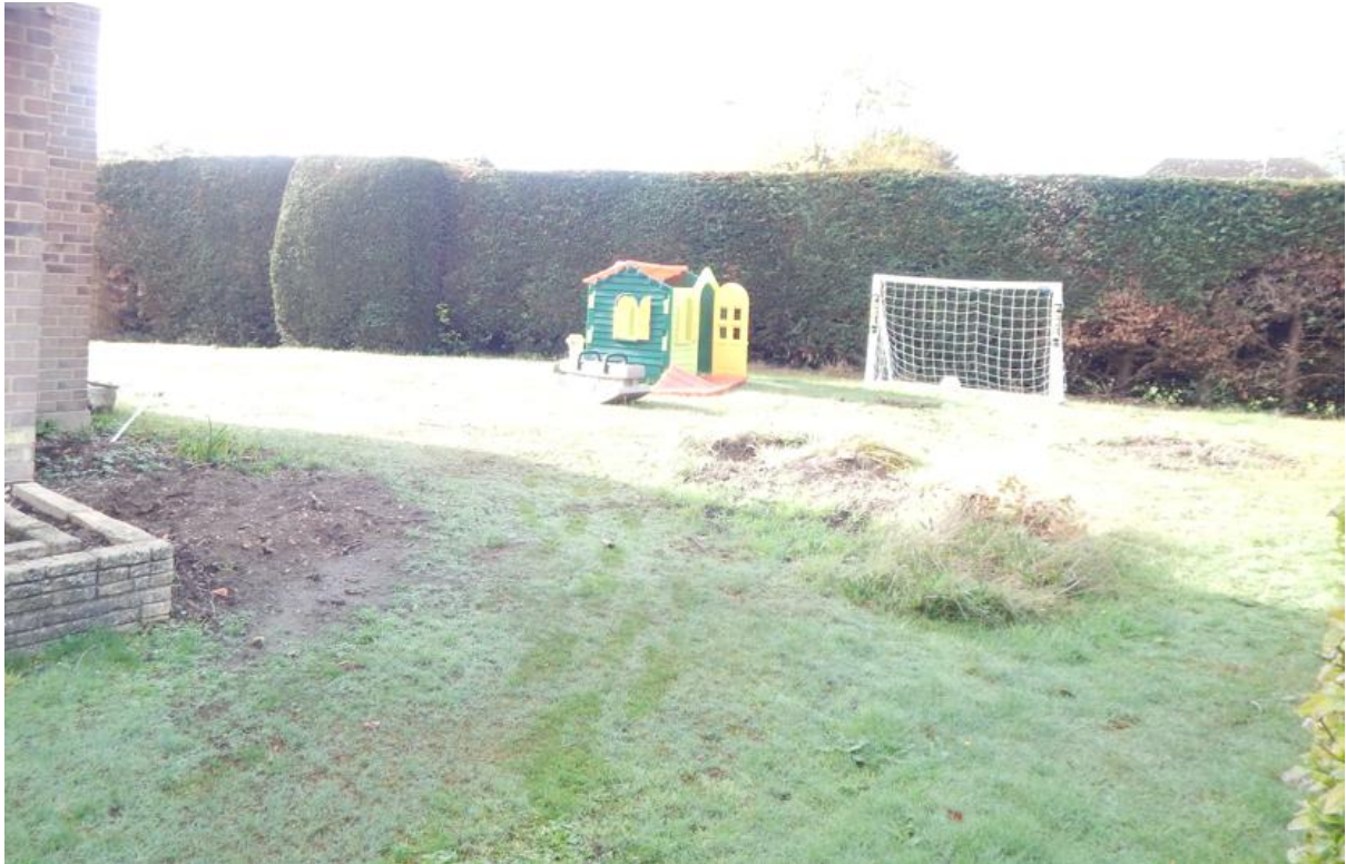
Image 4 – View looking North to South along West boundary hedgerow which is proposed to be removed