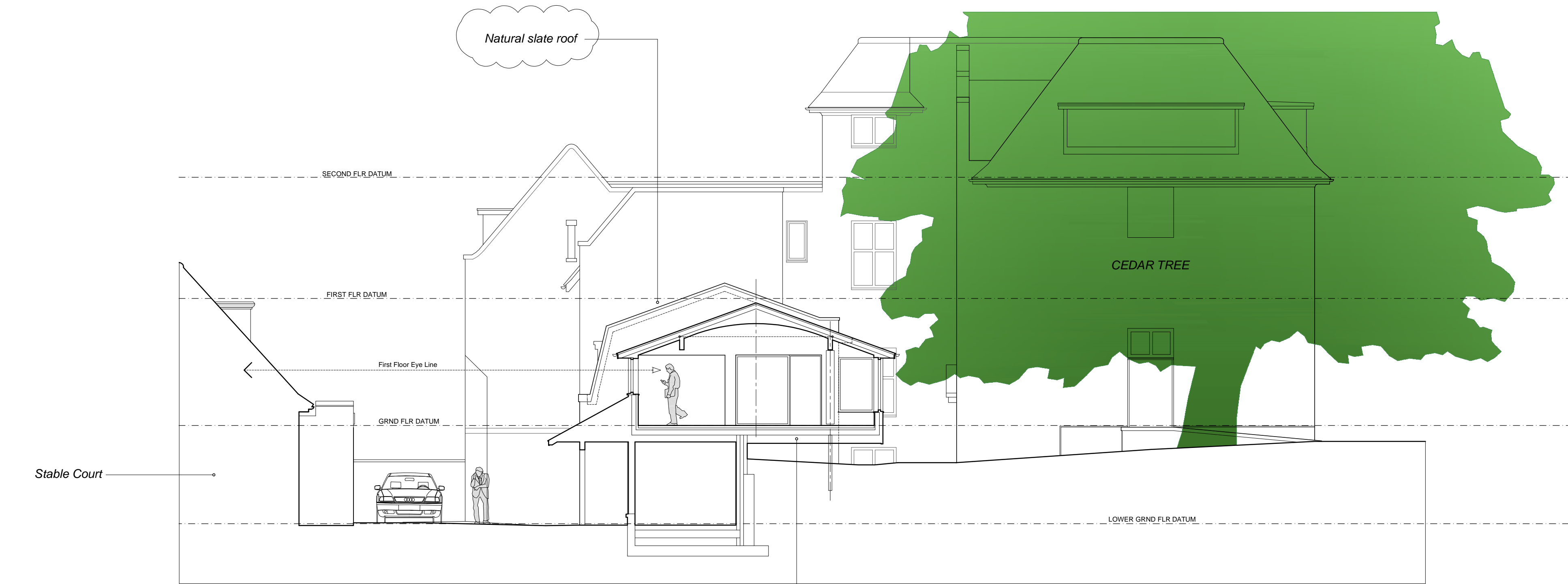
Section c (Proposed Link Bay Projection)

Rev C : Notes amended as LPA 21.07.25 : 22.07.25 Rev B : Link wing and staircase massing modified - 09.06.25 Rev A : Scale bar modified : Mar 25