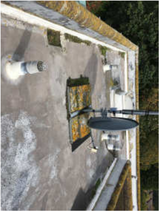
EXISTING ROOF - 1950's Wing