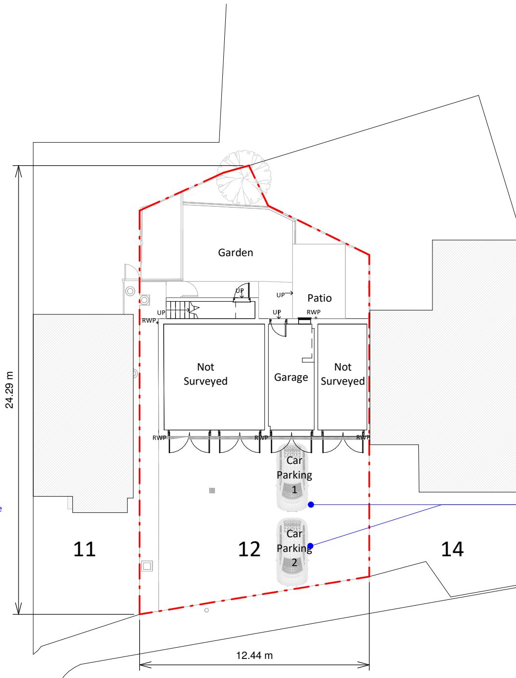
Ground Floor Plan - Proposed