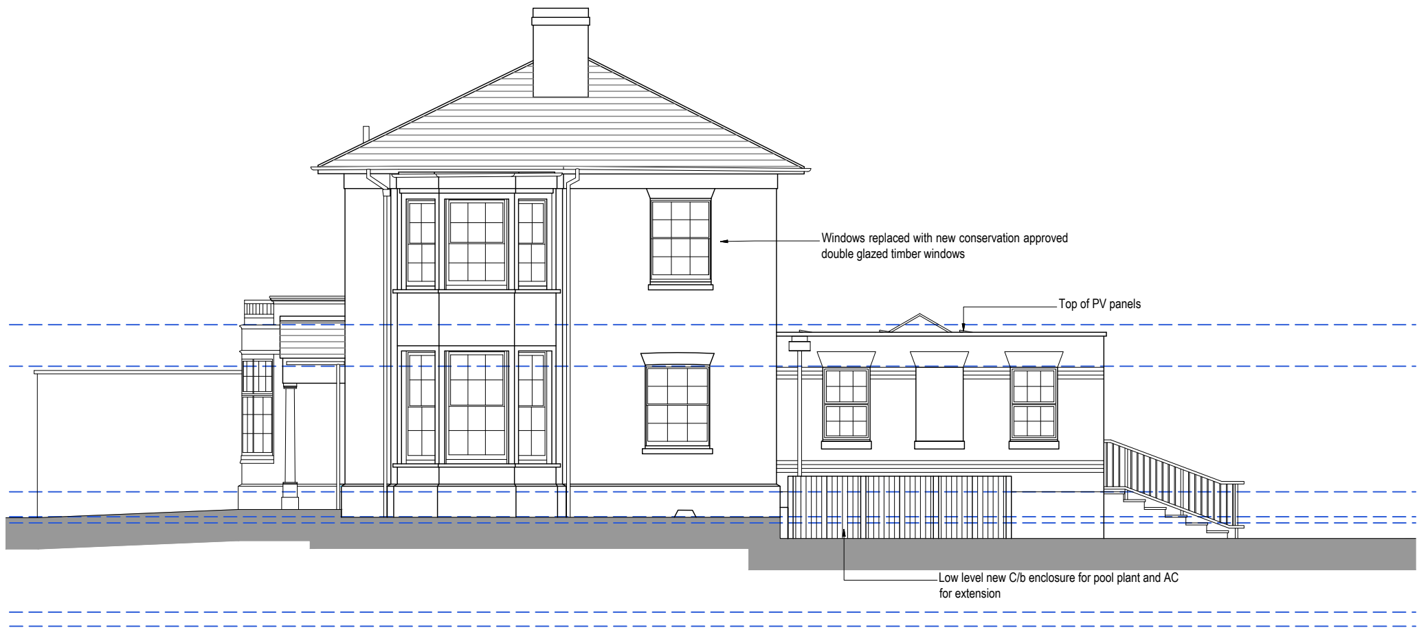
Proposed Side Elevation - 1:100 @ A1 *demolition layer turned off