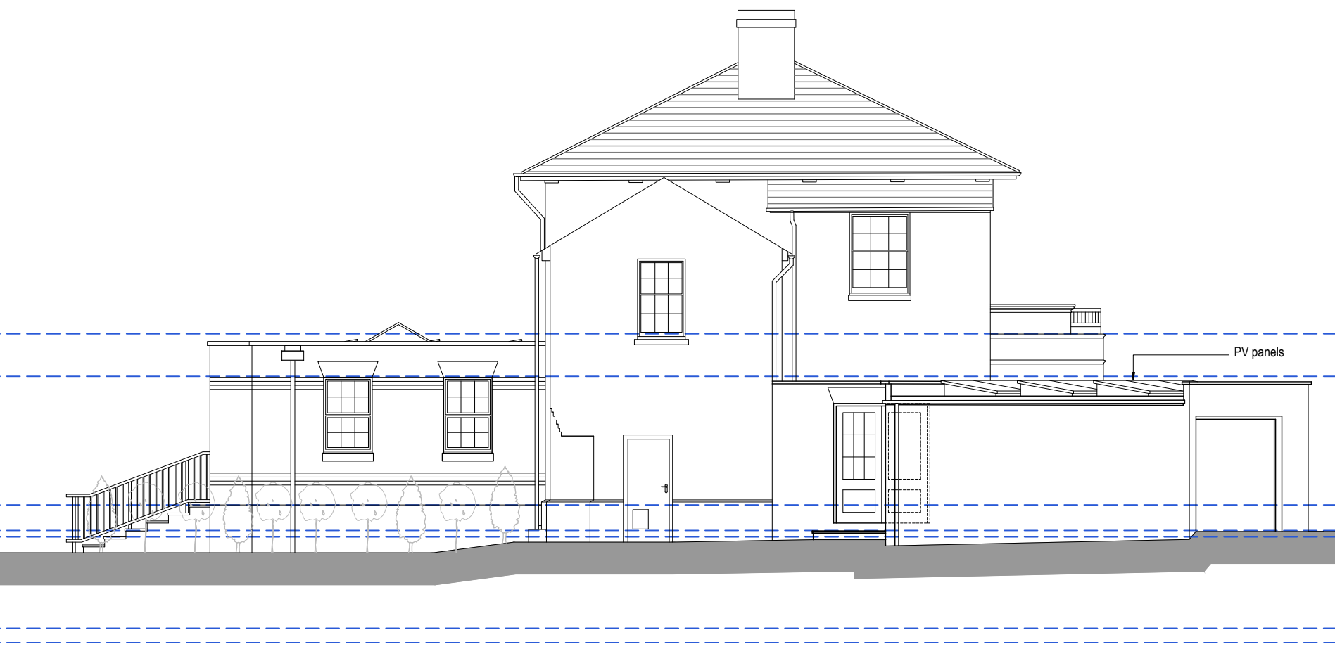
Proposed Side Elevation - 1:100 @ A1 *demolition layer turned off