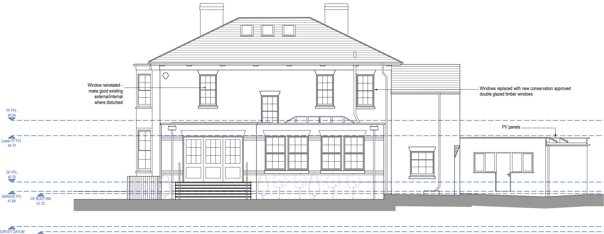
Proposed Rear Elevation - 1:100 @ A1 *demolition layer turned off