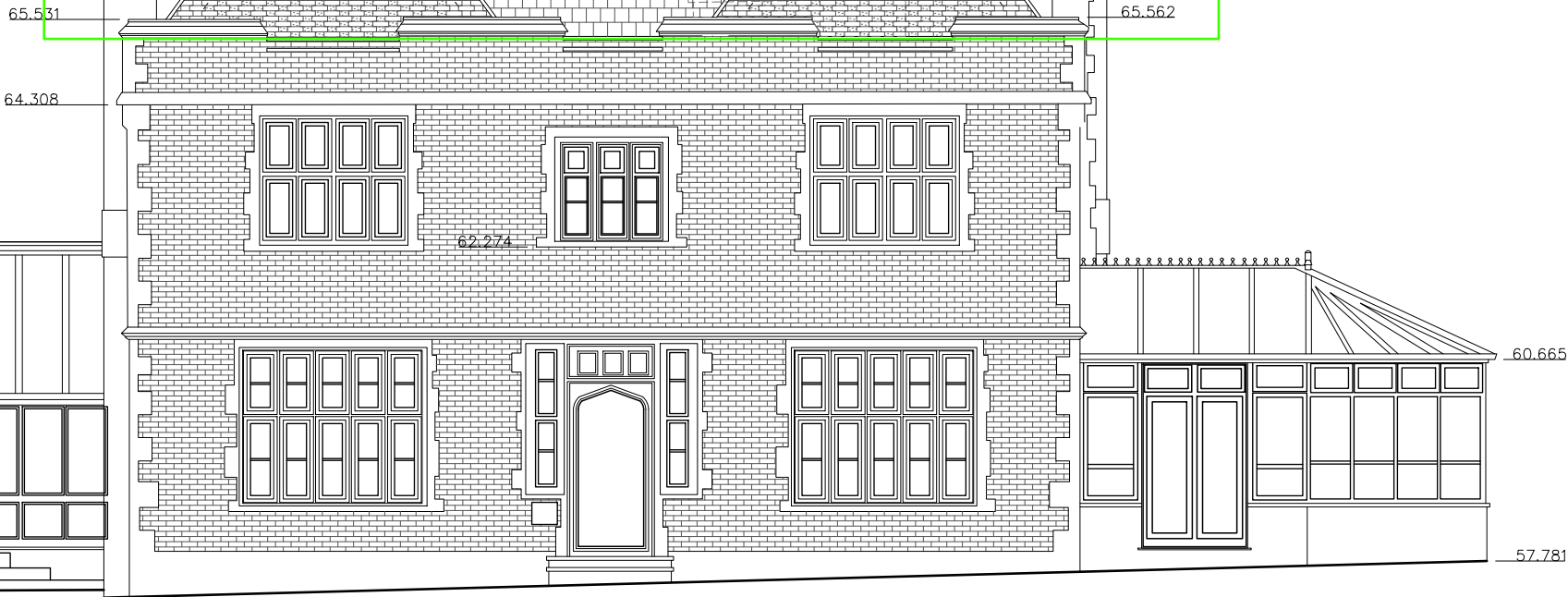
SW ELEVATION – ENTRANCE

CHANGES FROM APPROVED PLANNING REF 233180