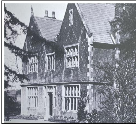
Photo of the property prior 1942

CHANGES FROM APPROVED PLANNING REF 233180