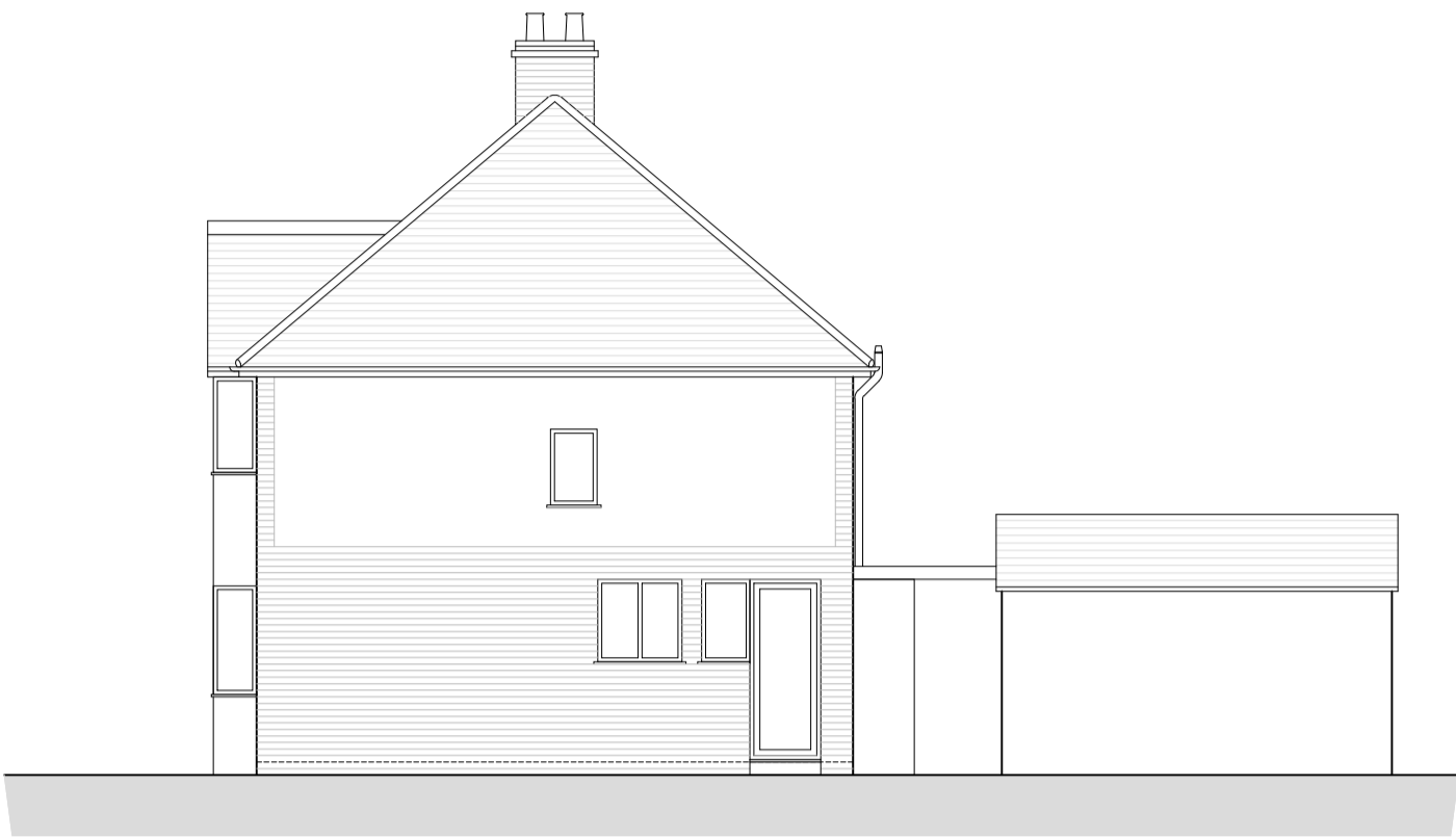
PRE EXISTING NORTH ELEVATION SCALE 1 : 100