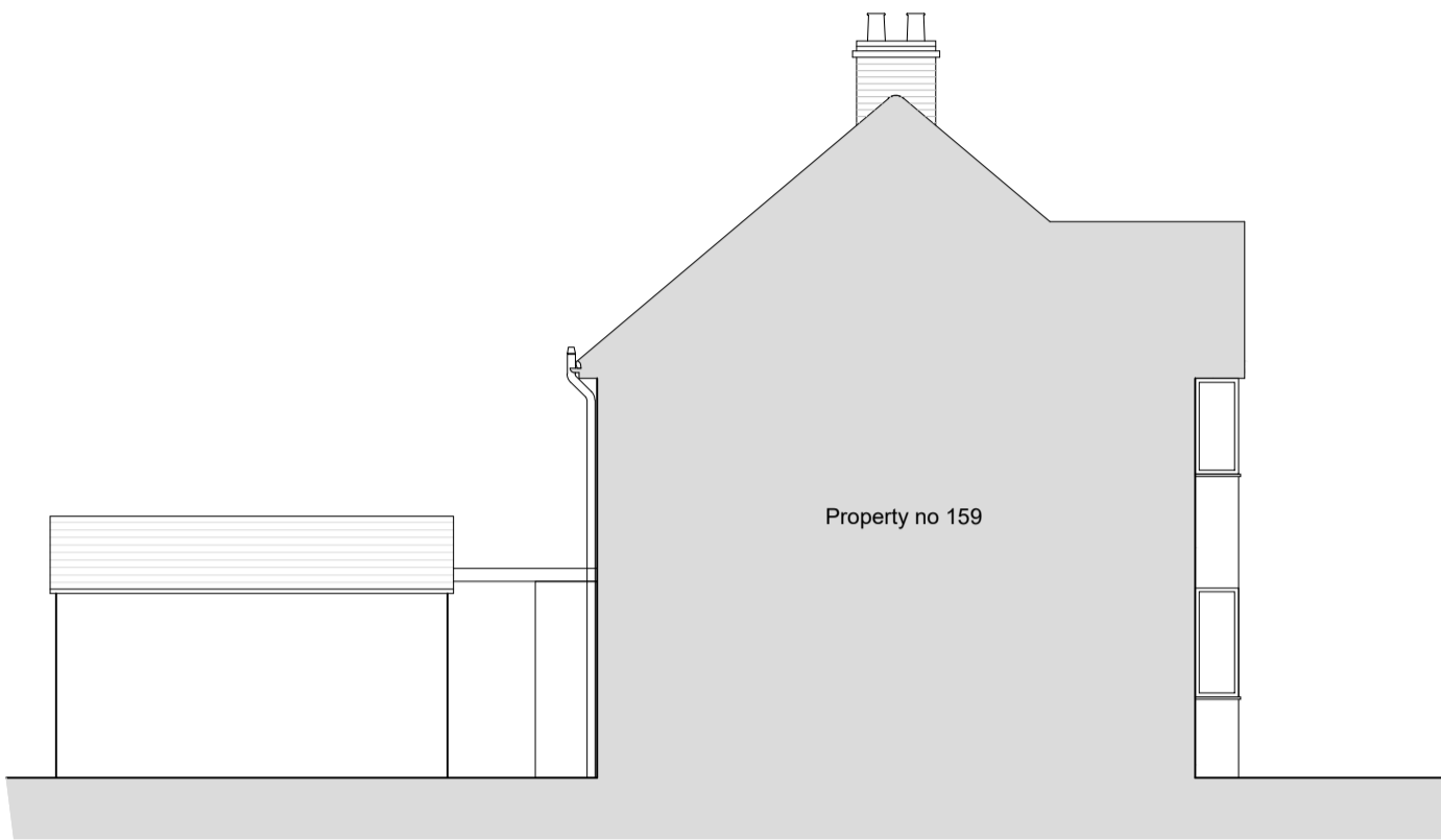
PRE EXISTING SOUTH ELEVATION SCALE 1 : 100