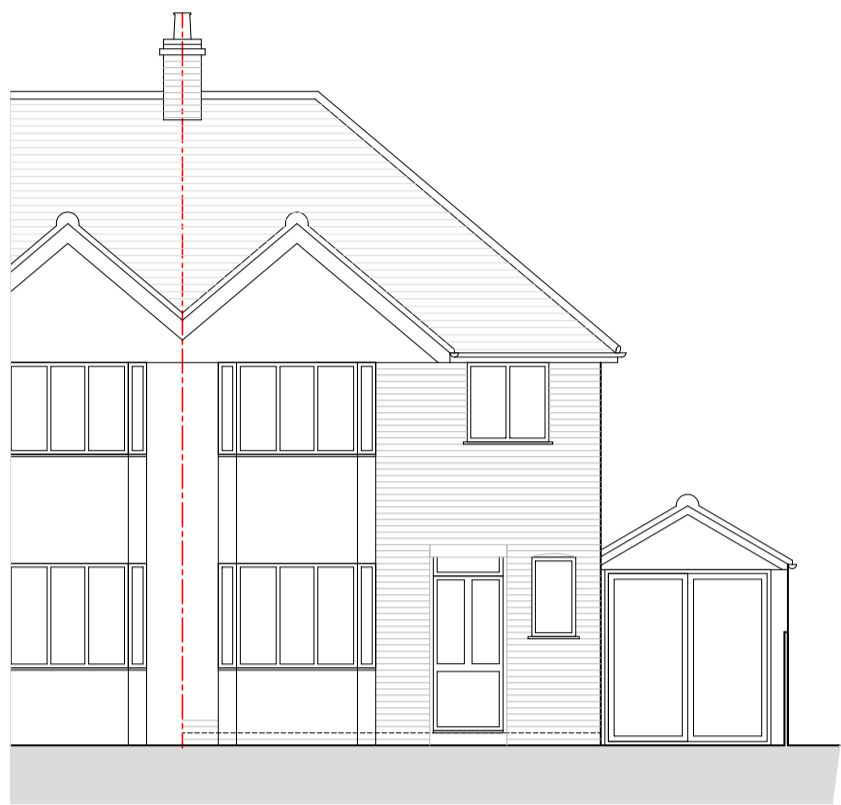
PRE EXISTING EAST ELEVATION SCALE 1 : 100