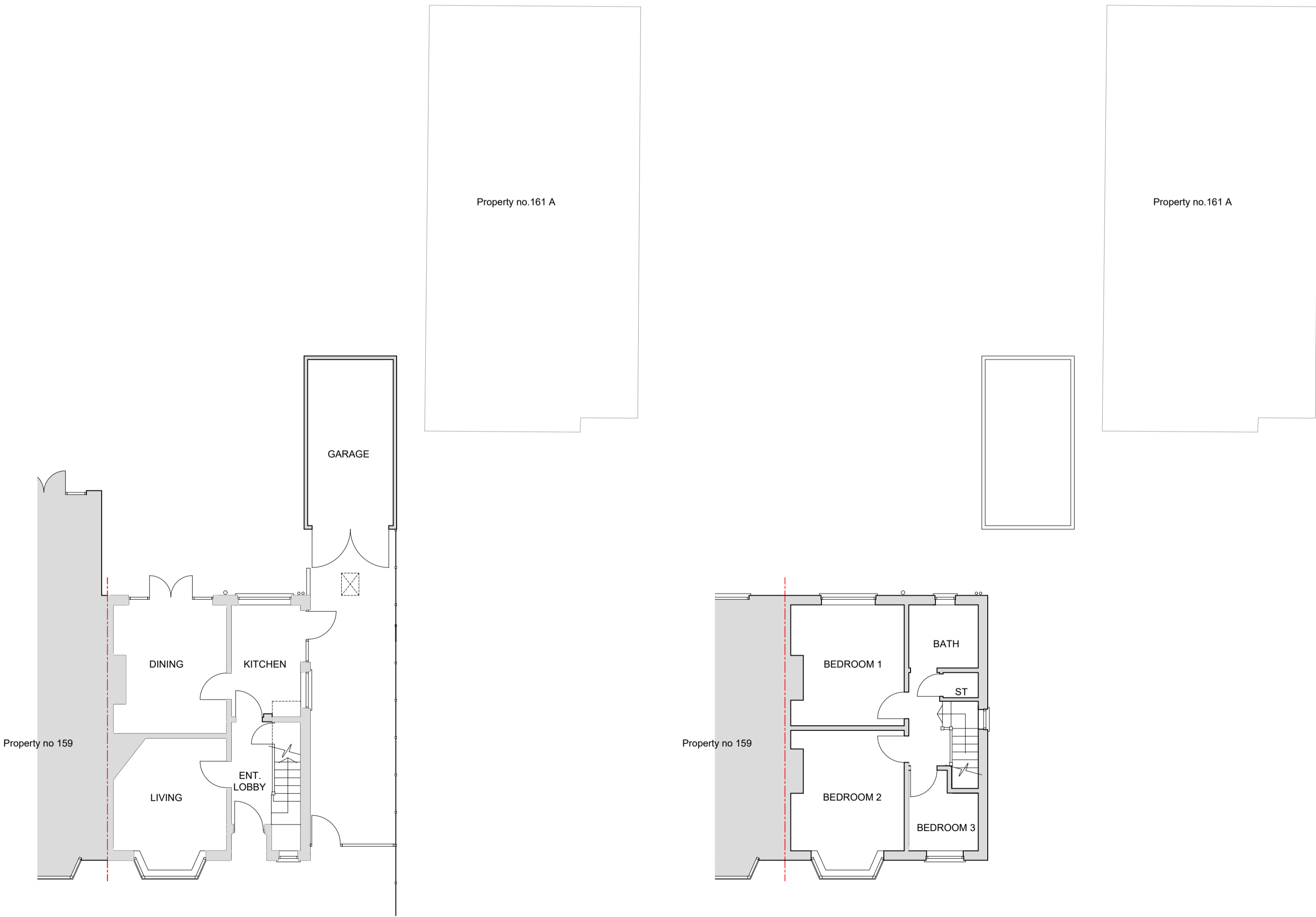
PRE EXISTING GROUND FLOOR PLAN SCALE 1 : 100